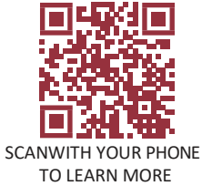
SCAN WITH YOUR PHONE TO LEARN MORE

Attention all Teachers! Come Join Our Team! Call TUSD HR: (209) 830-3260 For More Information Contact TUSD Human Resources