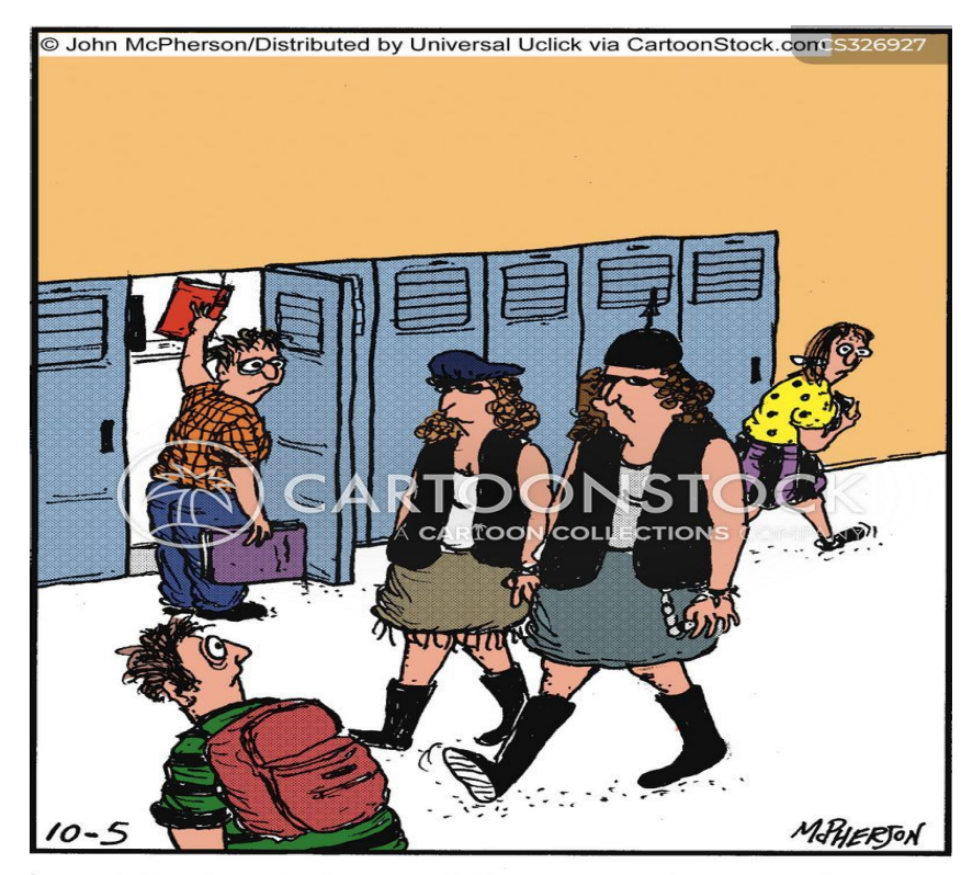
The faculty's new biker gang dress code dramatically reduced discipline problems at Welsner Junior High.