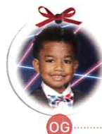
OG OH Ornaments (Glass) $19 3" glass ornament & ribbon w/ year, choice of two styles