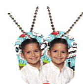
DT Tags $17 Set of 2 durable, high quality metal tags w/ chains