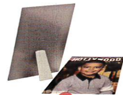
TP Tin Print $36 8 x 10" high quality metal print with built-in stand