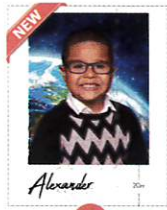
NA NB NC ND Name Prints $13 8 x 10" portrait w/ student's name & year, choice of four styles