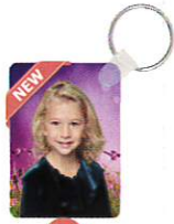
KC Key Chain $16 2 1/4 x 1 1/2" durable, high quality aluminum tag w/ key ring