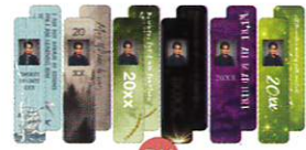
BK Bookmarks $13 Six 1 x 4" laminated bookmarks novel quotes w/ year