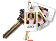
KF Key Fobs $13 Set of three 1 x 2" laminated fobs w/ year