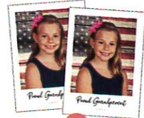
GP Grandparent Prints $13 Two 5 x 7" portraits w/ year "Proud Grandparent"