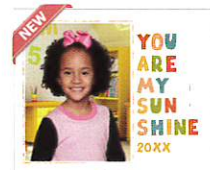
SH Sunshine Print $13 8 x 10" portrait w/ year "You Are My Sunshine"