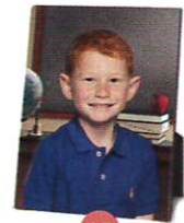
AP Acrylic Print $36 8 x 10" portrait high quality acrylic w/ stand