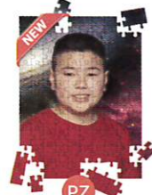
PZ Puzzle $22 8 x 10" 99-piece puzzle