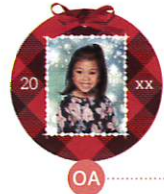
OA OB OC OD OE OF Ornaments (Aluminum) $17 3" aluminum ornament & ribbon w/ year, choice of six styles