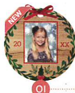
OI OJ Ornaments (Wood) $19 3" wood ornament & ribbon w/ year, choice of two styles