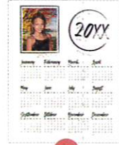
CA Calendar $13 8 x 10" portrait w/ year calendar