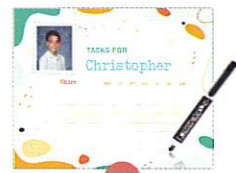
CC Chore Chart $18 8 x 10" dry-erase board w/ marker student's name