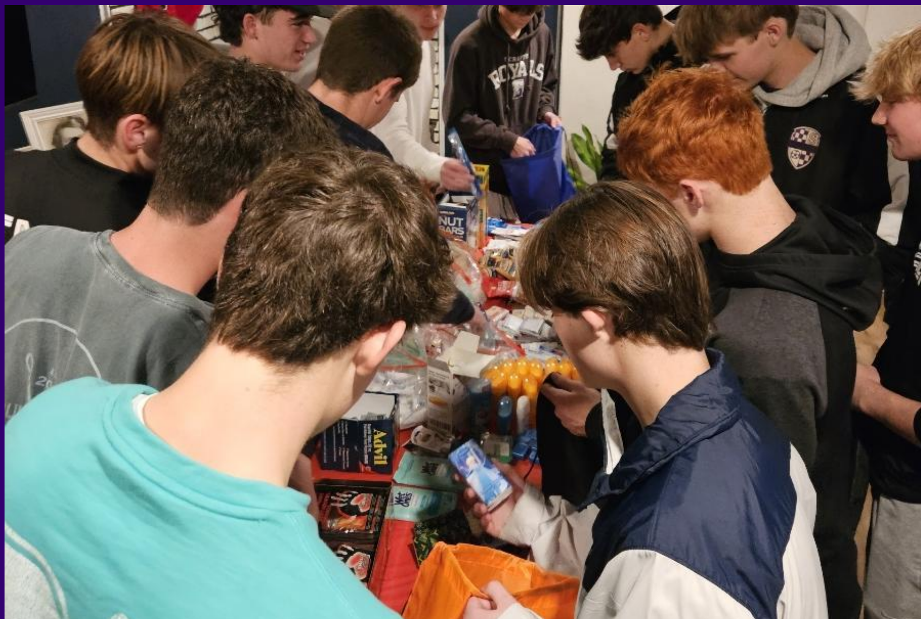
Boys Varsity Soccer team create "blessing bags."