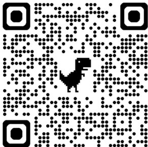
Handbook QR Code

Please sign and return to your child's classroom teacher OR use this link to sign this document Kenneth J. Carberry Elementary School Student Handbook 2024-2025 Form