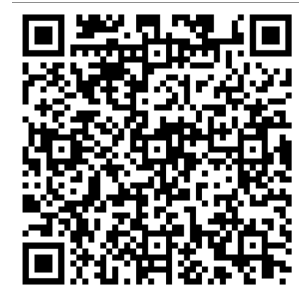
Form to sign off