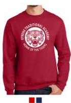
Crewneck & Hooded Pullover Sweatshirts

Enter through the 'i' door directly to the library on the East (Metro) side.