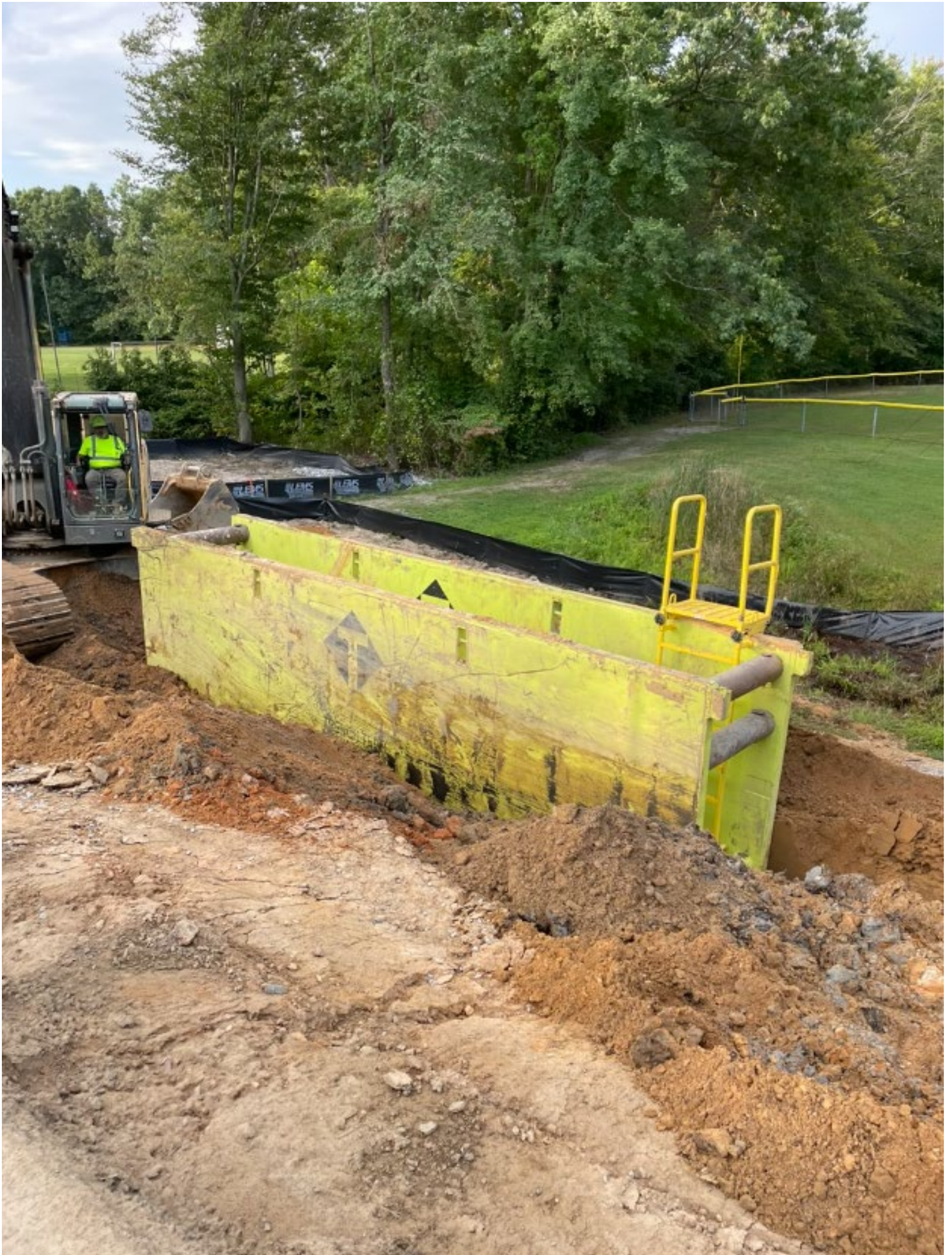
NORTH EAST MIDDLE / HIGH SCHOOL – SITE CLEARING AND STABILIZATION