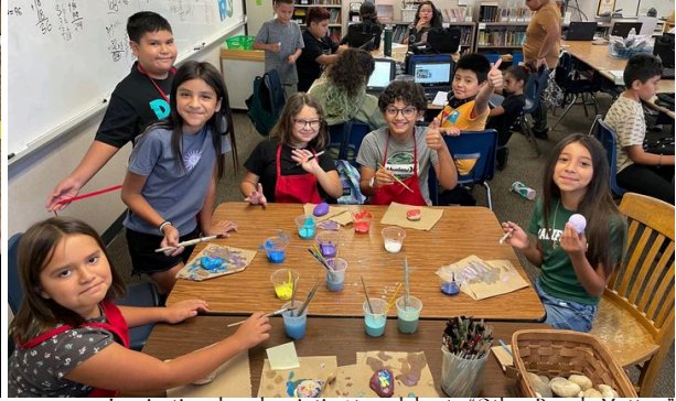
Inspirational rock painting to celebrate "Other People Matter."