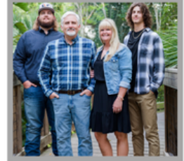
Secondary Study Hall