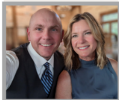
2nd Grade Aide