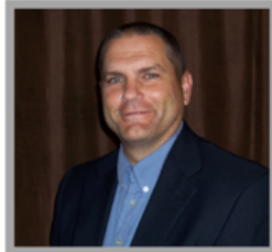
Middle School Math