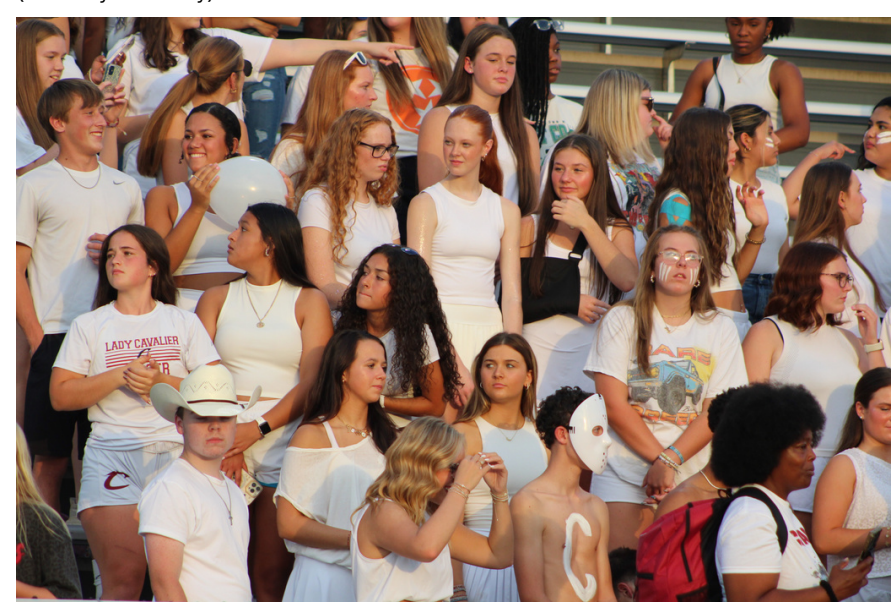
Below: The Cavalier Crazies went with a "White-Out" theme for the battle with Ripley...