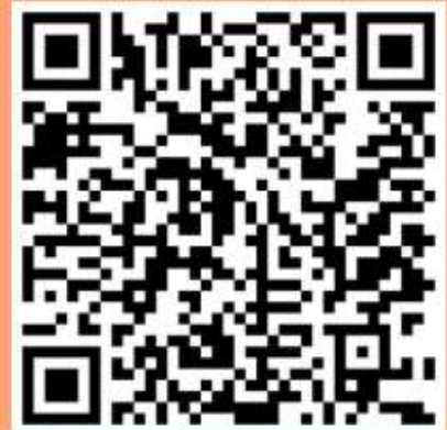
QR code for the Resource Library Form

Want to learn more? Check out our infomercial!