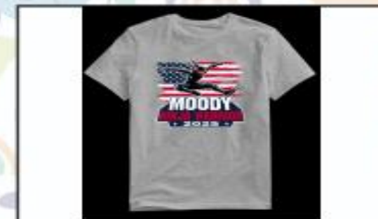
YOUR CUSTOM DESIGN