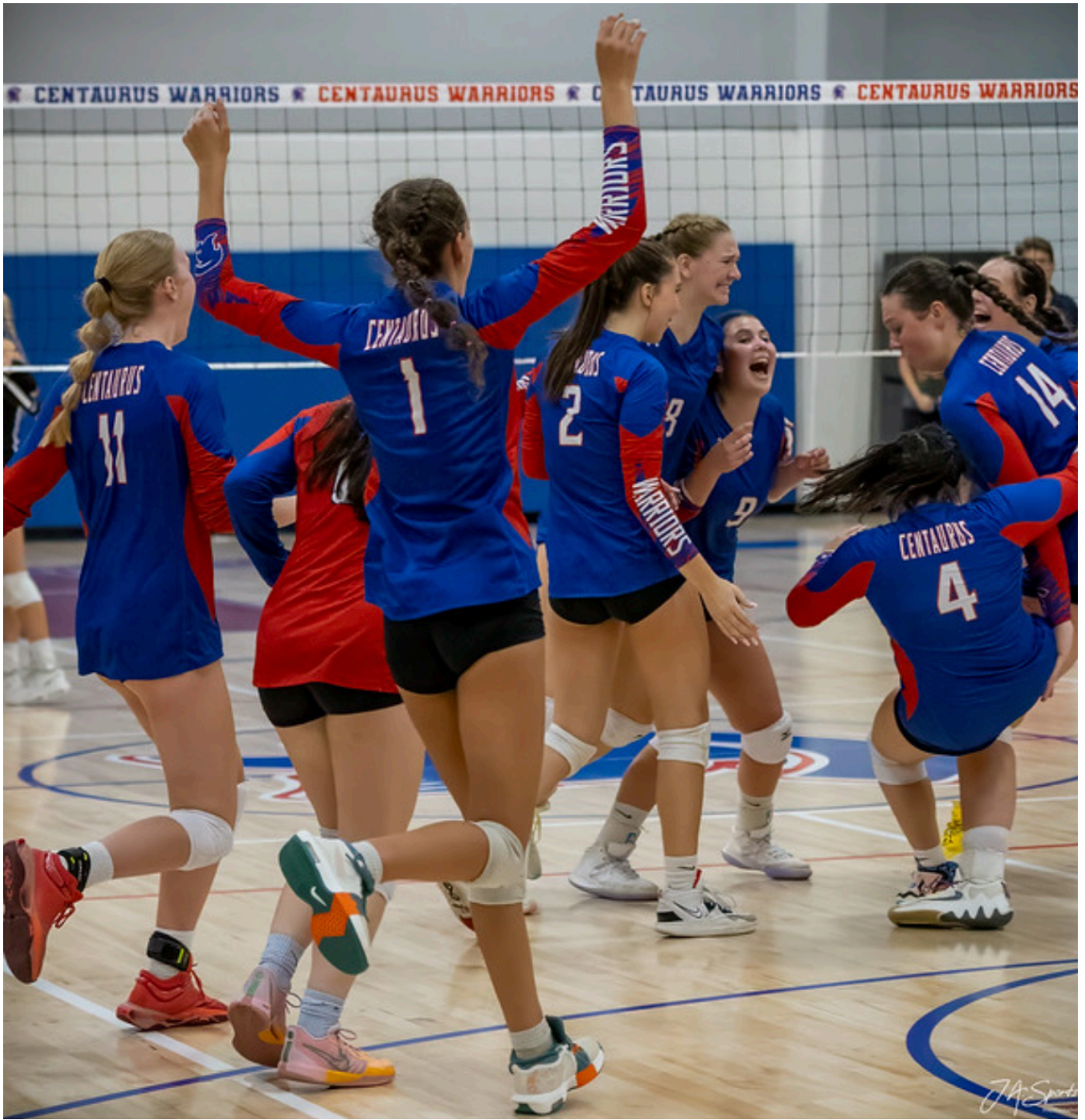
Girls volleyball opened the season with an exciting five-set home victory over Peak to Peak!