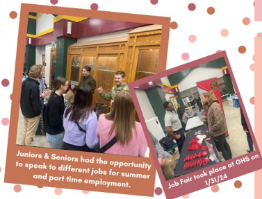
Juniors & Seniors had the opportunity to speak to different jobs for summer and part time employment.