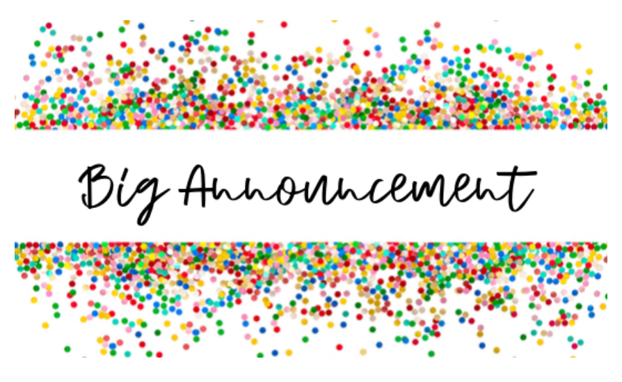
Announcing our new 2024/25 FGIS Staff