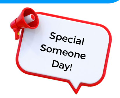
Friday, September 30 @ 12:30 PM All Grades!

We appreciate anytime you are available to support our school, although in person may not be possible at this time! Teachers invite the support of families who have offered to collate papers, record student information, and/or tear out workbook pages. Thank you for sharing your talents (and muscle) in and out of the classroom.