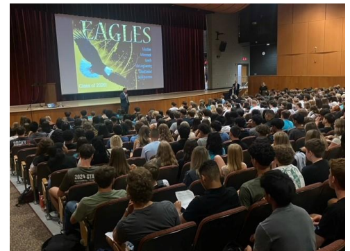
Class 2026 Assembly