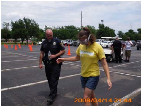
Figure 1 A student walks the line while wearing Fatal Vision Goggles, which simulates impaired vision.

The possession, use and sale of alcohol on the District's campus are governed by the Districts' drug and alcohol policies (found in the MNTC Student Handbook), the Drug-Free School/Workplace Policy (found in the MNTC Staff and Faculty Handbooks) and Oklahoma law. The enforcement of alcohol laws and policies on campus is the primary responsibility of Educational Services and Long Term Programs.