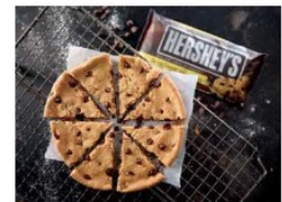
200 Cal/Slice (8 Slices)

1-877-UBS-HERO (827-4376) www.UnitedBloodServices.org