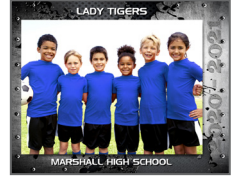
Team Picture = Team Only