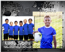
Memory Mate = Team & Individual!