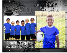
Memory Mate = Team & Individual!