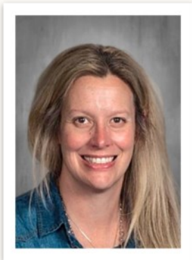
Ms. Scena Support Services