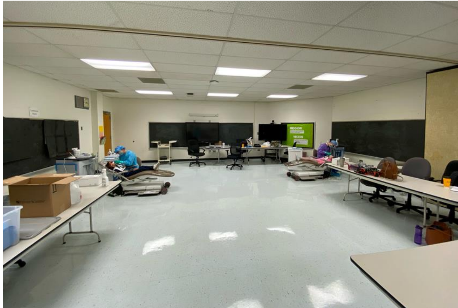
Star Elementary in Montgomery County