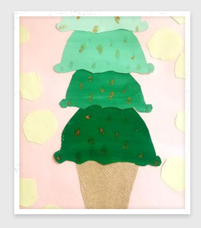
POP ART ICE CREAM