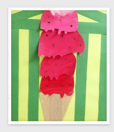
POP ART ICE CREAM