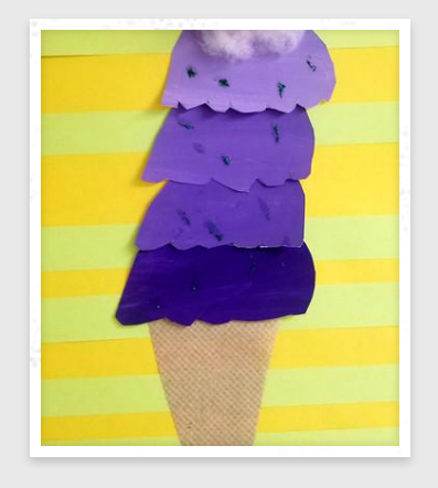
POP ART ICE CREAM