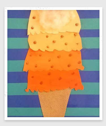
POP ART ICE CREAM