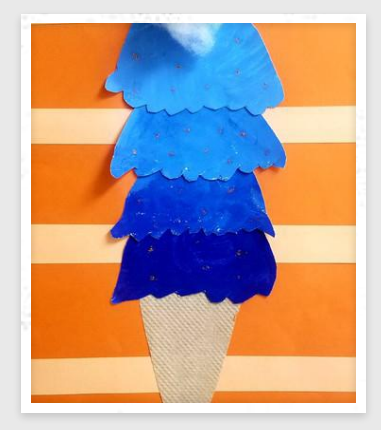
POP ART ICE POP ART ICE CREAM