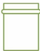
ONE-GALLON FREEZER BAG