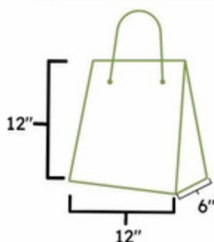
CLEAR PLASTIC BAG can not exceed 12" x 6" x 12"