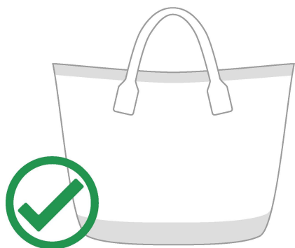
12" x 6" x 12" CLEAR TOTE