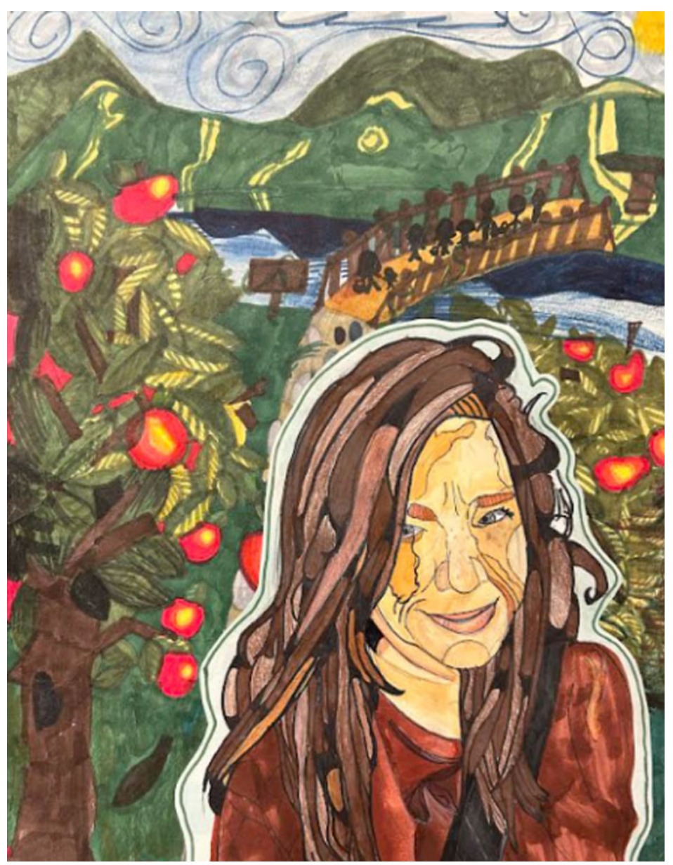
Visit <u>www.wboro.org</u> for the latest event dates/times and information.