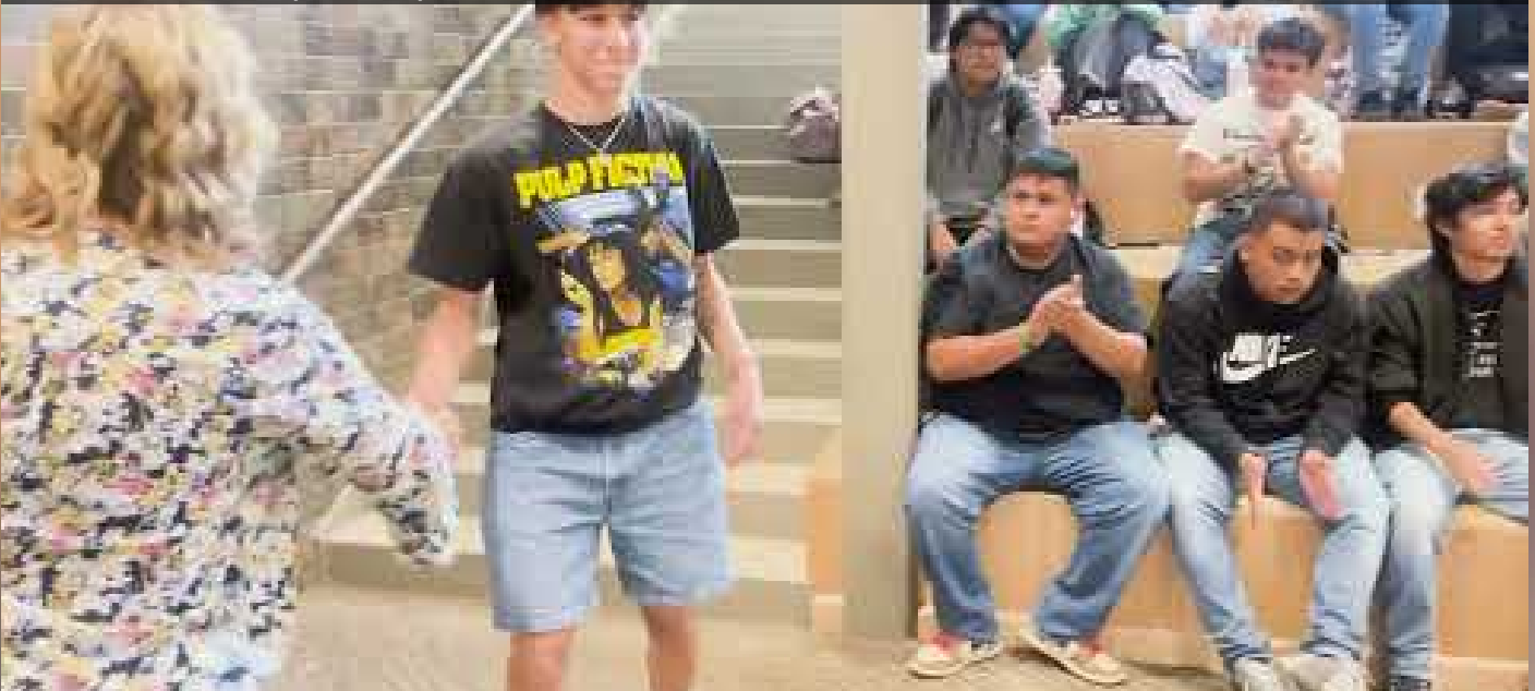
MEF Scholarships Recipients - Class of 2024

Additionally, the Mapleton Education Foundation awarded 30 seniors scholarships this year, providing a combined $250,000 to support graduates in pursuing their post-secondary dreams. We were there to capture the moment seniors got the good news and you can watch their reactions in the video below.