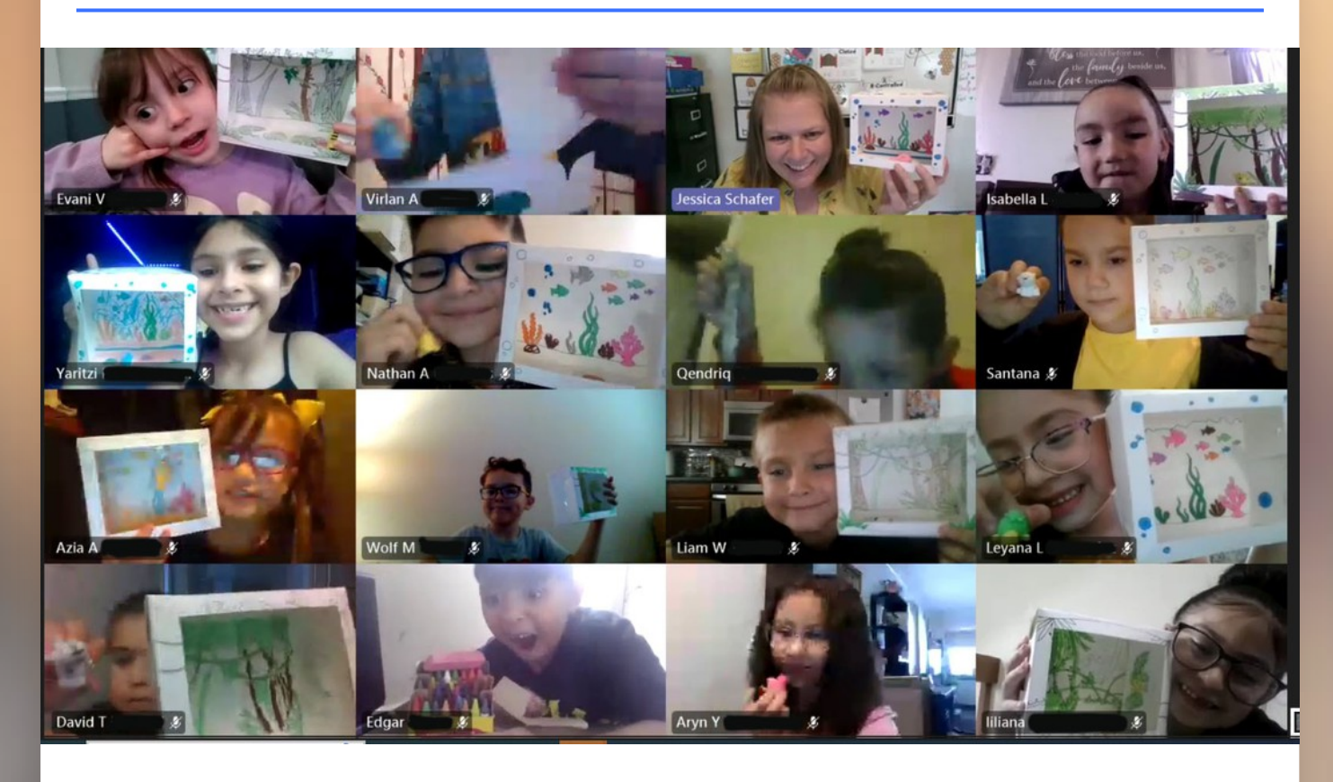
"Desk Pets" get habitat makeovers at Mapleton Online

The Tuesday Takeaway is a weekly e-newsletter distributed to all Mapleton staff. This quick-hit-style newsletter contains the news you need for the week ahead!