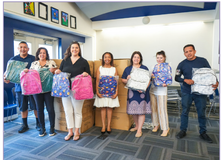
Supplies Donation from Costco