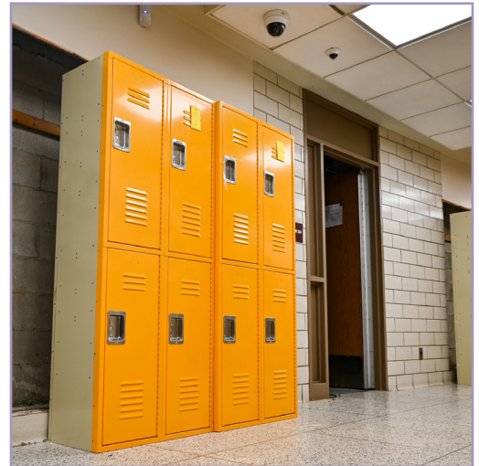
New High School Lockers

Technical Support: If any community member, parent, or student needs technical assistance, please visit our newly updated support page at https://centralislip.k12.ny.us/support . This page contains useful information and resources for parents and community members to help keep children safe and productive online. Don't hesitate to contact your child's classroom teacher or building principal if you have any questions or concerns.