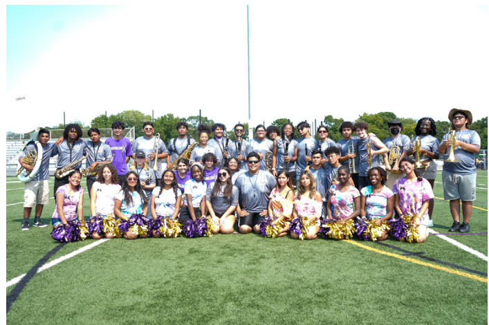
CIHS Marching Band Seniors