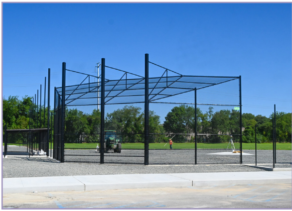
Enhanced Outdoor Spaces