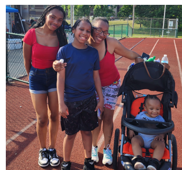
Bearcat Families really enjoyed the festivities.