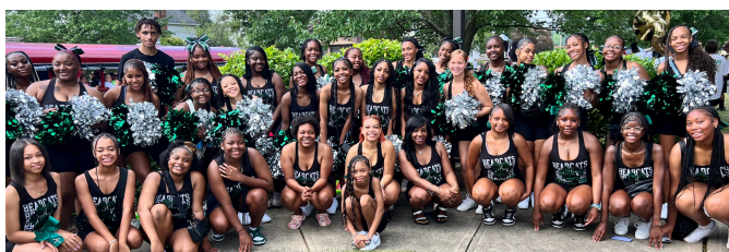
Members of BHS's Cheerleading Team attended and celebrated at the Fourth of July Parade.