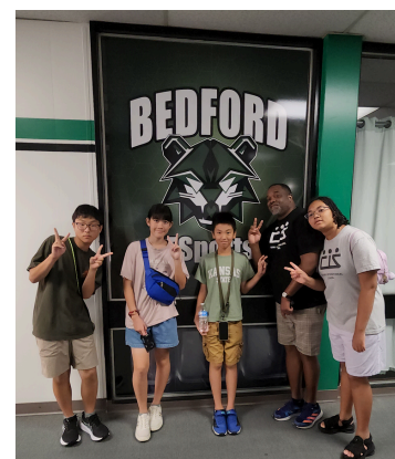
The students were eager to take a picture in front of The Bearcat Logo :)