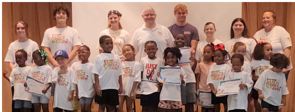
The City of Bedford's Safety Town Class of 2024 celebrating the 60th anniversary of Safety Town.