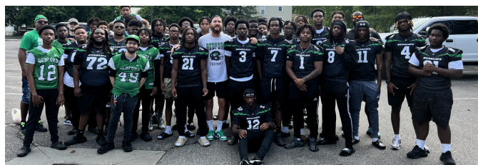
Members of BHS's Football Team attended and celebrated at the Fourth of July Parade.