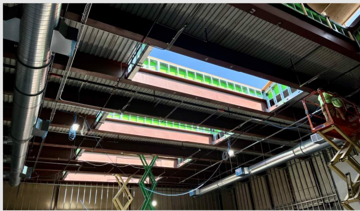
Top Left: a view of the natural light pouring into the High School Commons space from the new skylight openings

Feel that sunshine as you step into the High School Commons! This week the openings for the future skylights were cut and framed above the Commons. Roofing repairs are now underway around the openings ahead of the skylight install starting next week. Once the skylights are in place, the space will be "watertight" allowing drywall and finishes to begin. In the Kitchen, Served, and Student Lounge, the overhead MEPs and drywall are nearing completion. In the coming weeks paint, tile, and epoxy flooring finishes will commence.