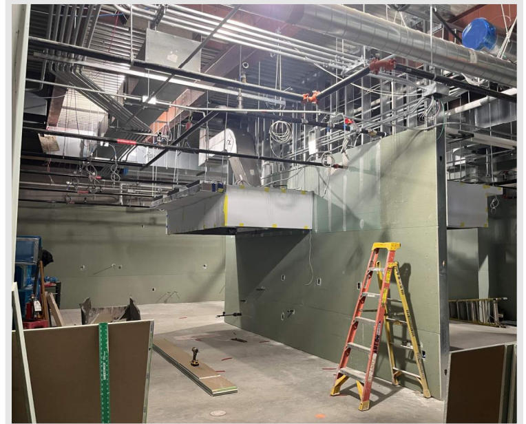
Bottom Right: a photo highlighting the MEP progress overhead as drywall install is underway