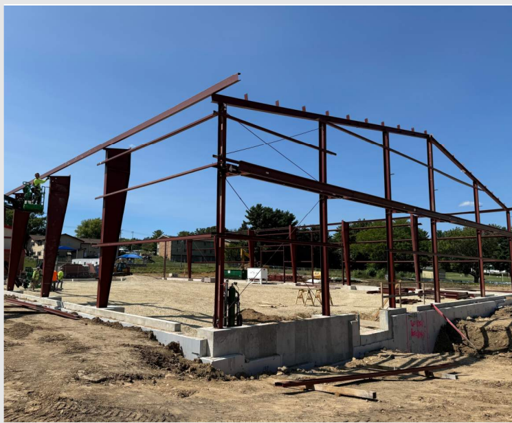
Bottom Left: a view of the structural steel erection progress on the new Maintenance Building shop / garage area