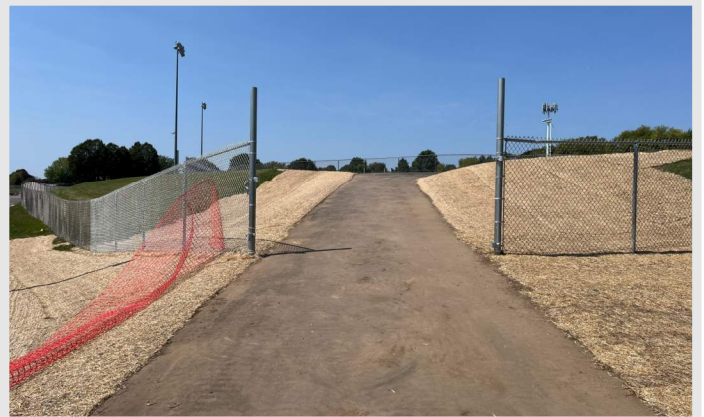
Top Right: a photo of the new fencing, landscaping, and entrance road to the football field

The summer blitz renovations in the High School Science Wing wrapped up this week, and staff has already begun preparing the space for school this fall! At the football stadium, the new fencing, landscaping, and access road have been completed just in time for the start of the sporting season. In the coming weeks, the new gate will go into place across the access road, forming a secure entrance for staff and emergency personnel.