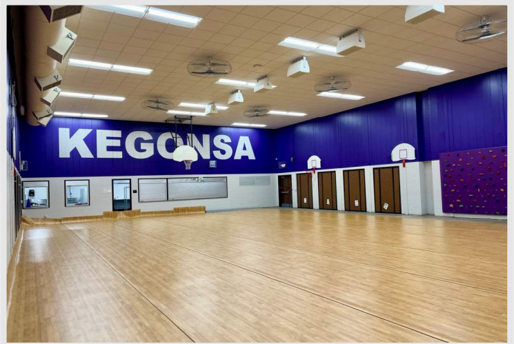
Above: a sneak peak of the new finishes in the Kegonsa Elementary Gym / Cafeteria space as flooring is installed