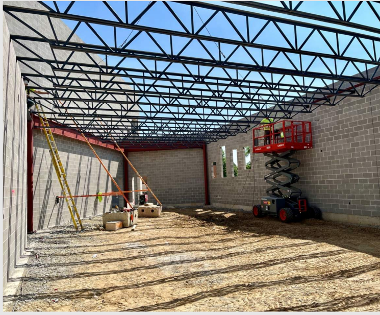
Top Left: a look into the future athletics room as steel joists are set overhead