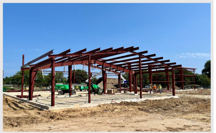
Above: a view of the steel structure erection progress at the new Maintenance Building

Foundations for the New Maintenance Building are complete at the Yahara site and erection of the steel structure is underway. Findorff ironworkers began setting structural steel members earlier this week, and wow, is the progress exciting! As the erection of the structure continues, trades like exterior wall framing and masonry will begin. Once the structure is fully erected, mechanical, electrical, and plumbing (MEP) underground rough-ins will begin.