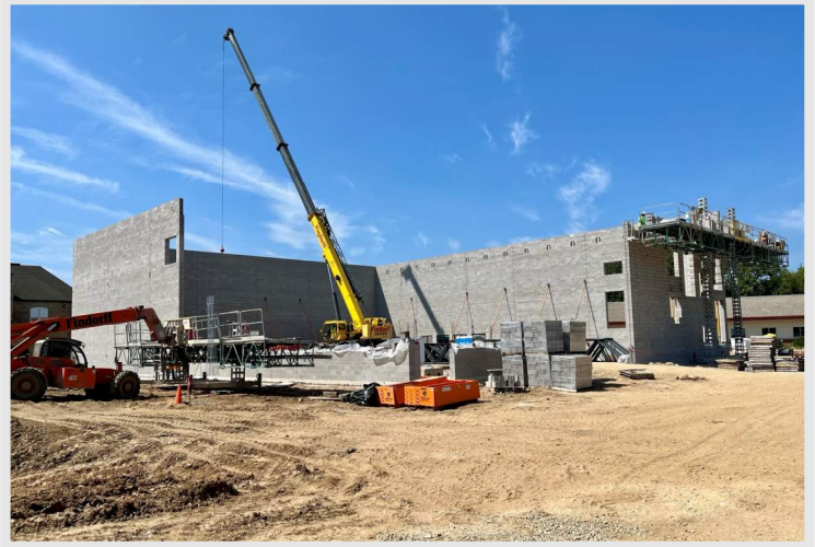
Above: a view of the overall progress at the River Bluff Middle School gym and athletics addition

Preparations for students and staff to return to campus are going into place. This includes additional sidewalks, directional signage, pavement striping, fencing, and new pavement for a temporary bus lane. We appreciate your patience and understanding as we welcome students and staff back onto campus after a summer of hard work!