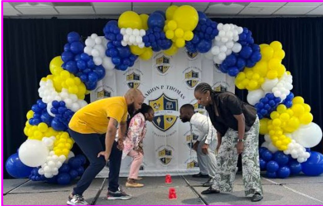
Padlet: Shout-outs & Good News