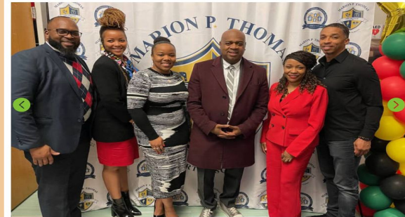
Mayor Ras Baraka spoke at Marion P. Thomas Charter School for the school's celebration of Black History Month.

Tells students to dream big and work hard