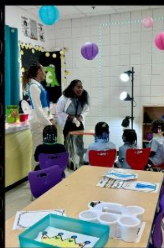
AUGUST 26, 2024