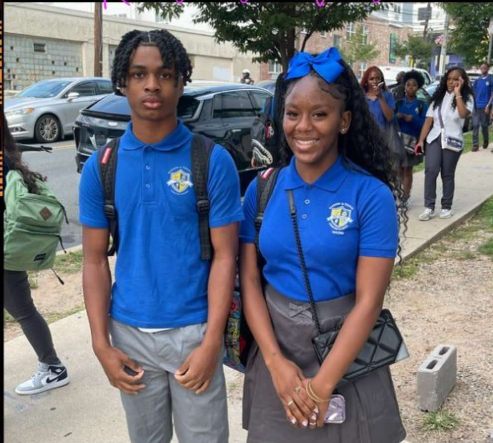
FIRST DAY OF SCHOOL PICS