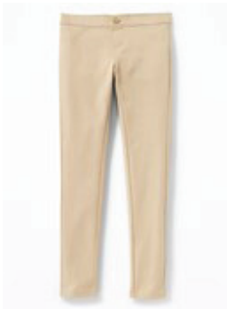
Not approved: Ponte-knit/ double knit jeggings