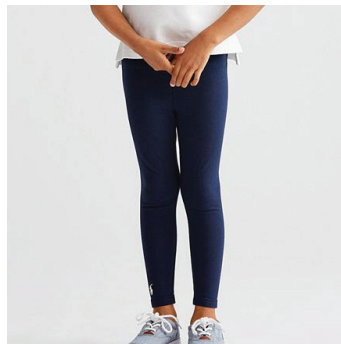
Not Approved: Leggings, tights, or stockings worn alone. May only be worn under a dress-code approved skirt, skort, or jumper.