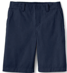
Approved: Cotton twill or polyester active performance chino/flat front golf shorts