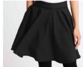
Approved: Loose-fitting cotton twill and knit cotton skirts (no more than three inches above the knee)