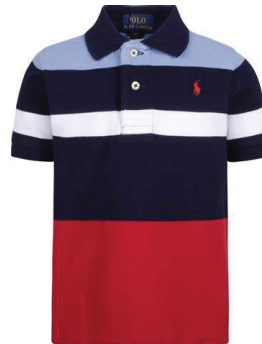
Not Approved: Patterned polos or polos with logos