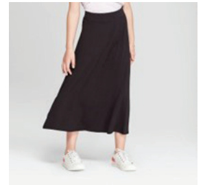
Approved: Loose-fitting cotton/knit maxi skirt