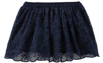
Not Approved: Clothing with lace accents or overlays