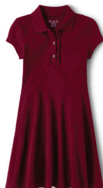
Approved: polo-style dress, must be no shorter than three inches above the knee