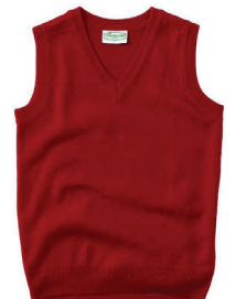
Approved: Uniform vest