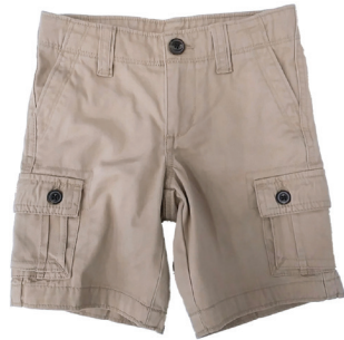
Not approved: Cargo shorts/pants