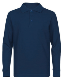
Approved: Cotton or performance long-sleeved polo