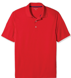
Approved: Cotton or performance short-sleeved polo

Tops, including polo-style dresses, are short or long-sleeved with collars and no logos in the following solid colors: navy, red, white, hunter green, burgundy. Except for the top button or snap, all shirt and blouse buttons or snaps must be fastened. Shirts must be tucked in at all times in the building except during physical-education classes. No hooded jackets or sweatshirts may be worn in classrooms or hallways beyond a student's locker or hook. Sweaters, non-hooded sweatshirts, vests, three-quarter zip pullovers, and dress jackets may be worn over a dress-code-compliant top and must be a solid dress-code top colors with no logo (Liberty Common logos are approved).