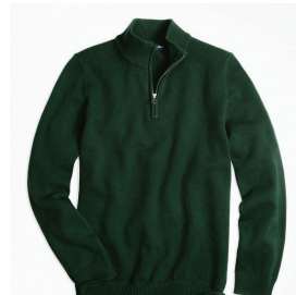
Approved: 3/4 zip, button down, or non-hooded sweater