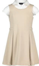
Approved: “Uniform” Jumper