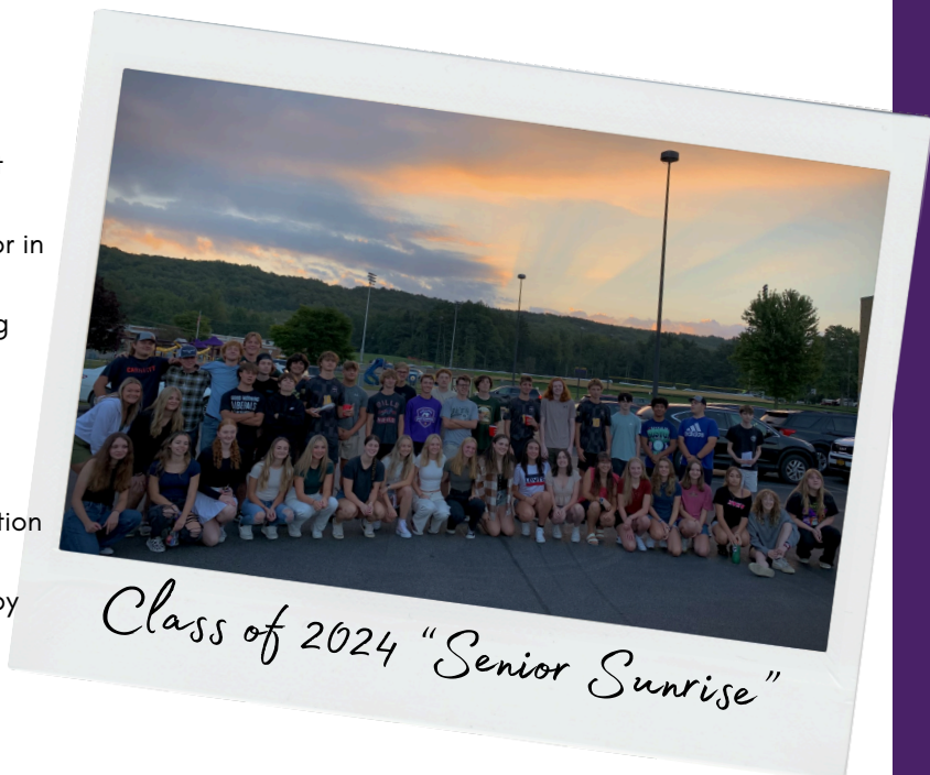
Class of 2024 "Senior Sunrise"