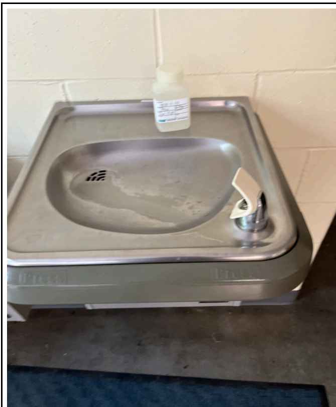
7/15/2024 - 9020-9 - Raytown Success Academy - Outside Gym - Right