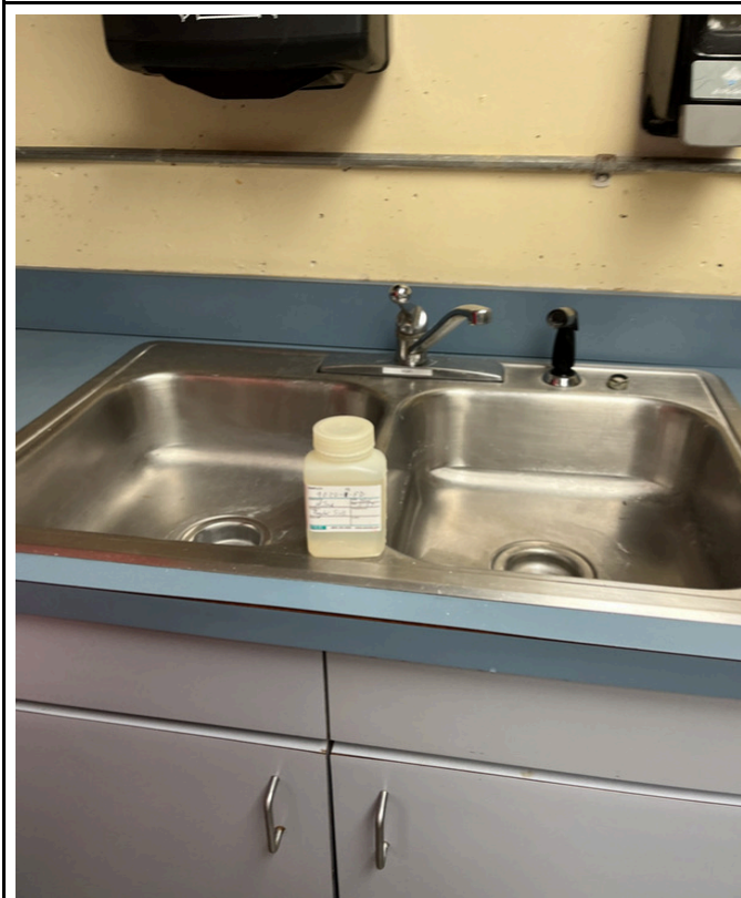
7/15/2024 - 9020-11 - Raytown Success Academy - Single Sink Kitchen