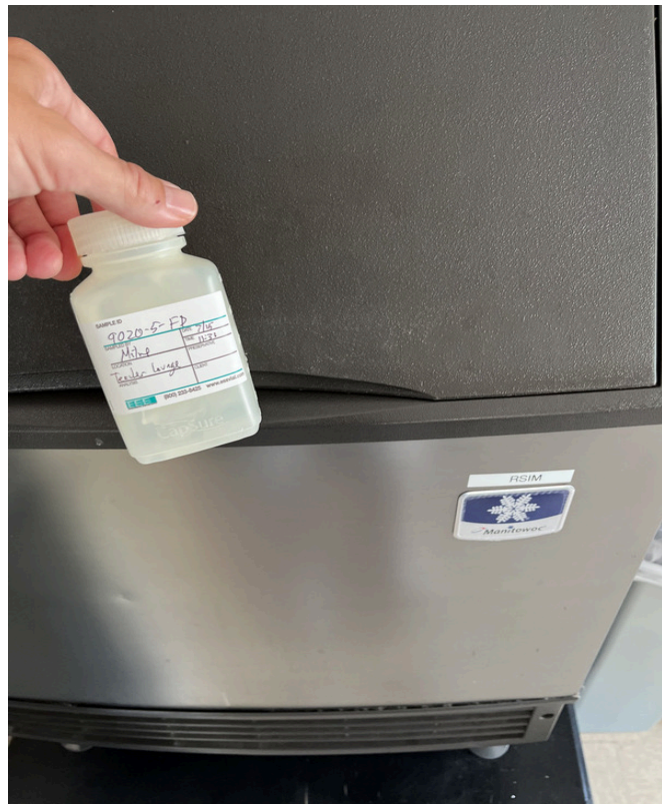
7/15/2024 - 9020-5 - Raytown Success Academy - Teacher's Lounge