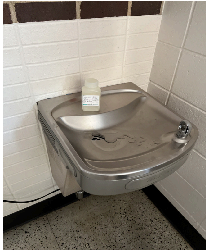
7/15/2024 - 9020-2 - Raytown Success Academy - North Hallway by Restroom