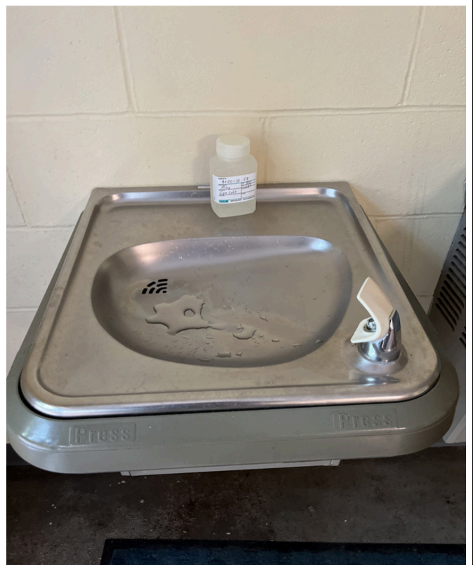
7/15/2024 - 9020-8 - Raytown Success Academy - Outside Gym - Left