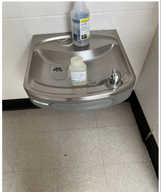
7/15/2024 - 9020-4 - Raytown Success Academy - Outside Room 306