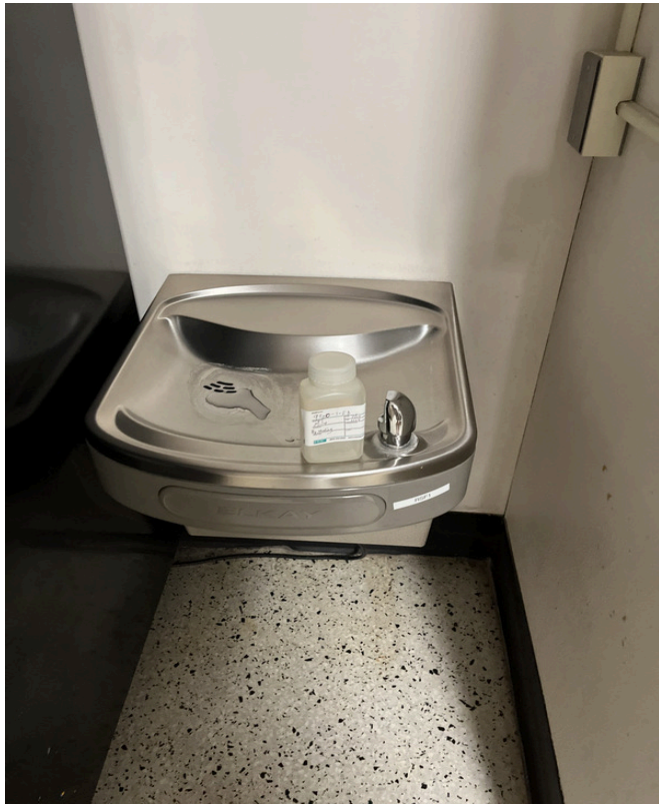
7/15/2024 - 9020-1 - Raytown Success Academy - Main Hallway by Vending Machine