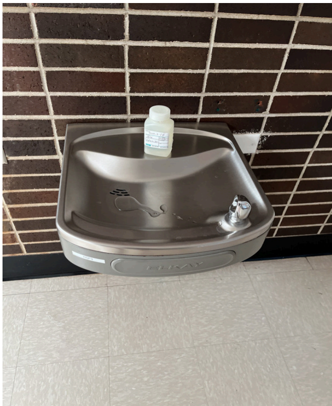
7/15/2024 - 9020-3 - Raytown Success Academy - Outside Room 315