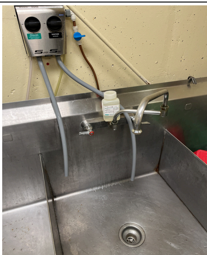
7/15/2024 - 9020-10 - Raytown Success Academy - Triple Compartment Sink