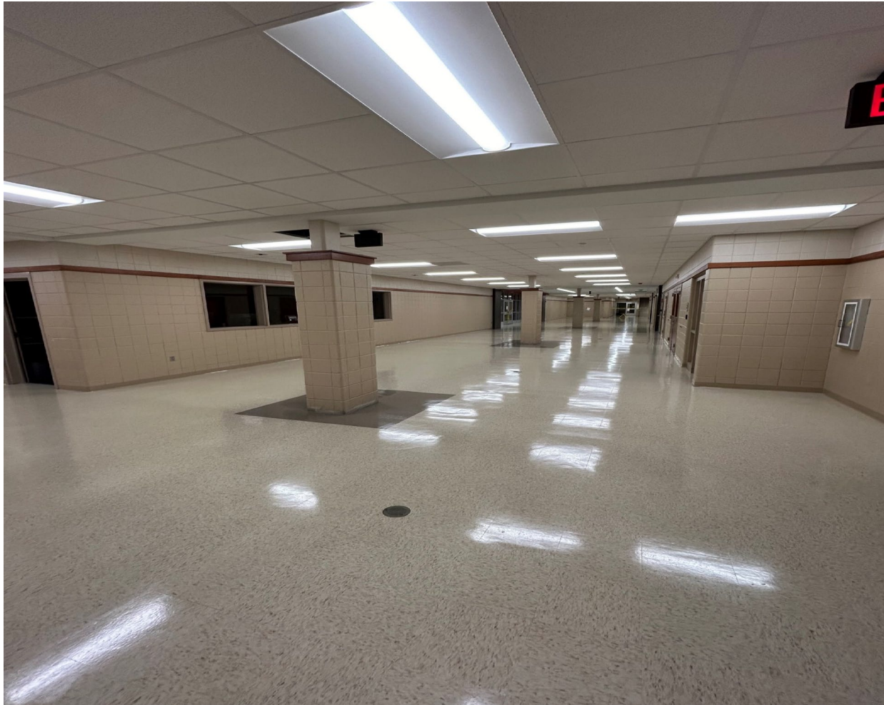
Hallway Renovation Completion