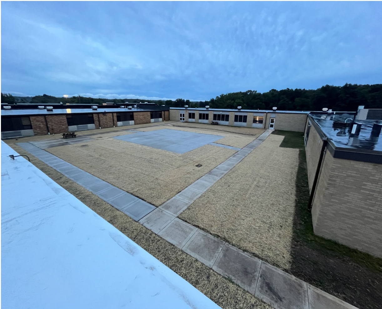
Hill Removal in Courtyard