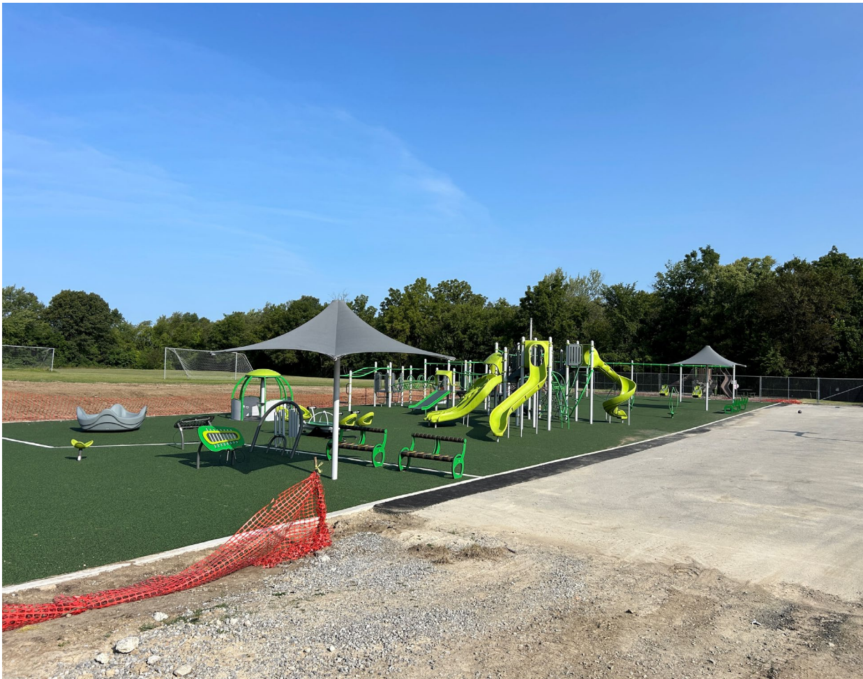
New Playground Progress