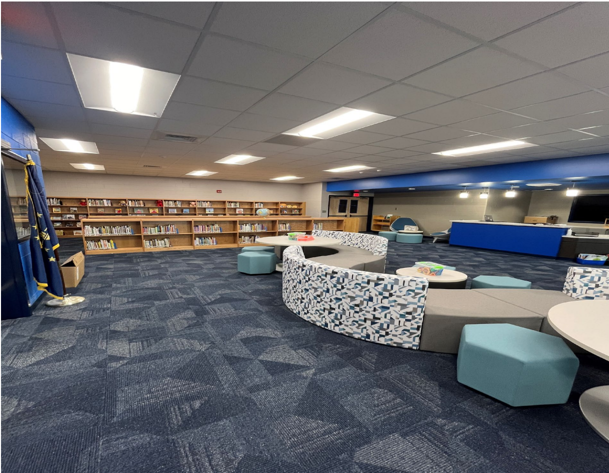
New Media Center Progress