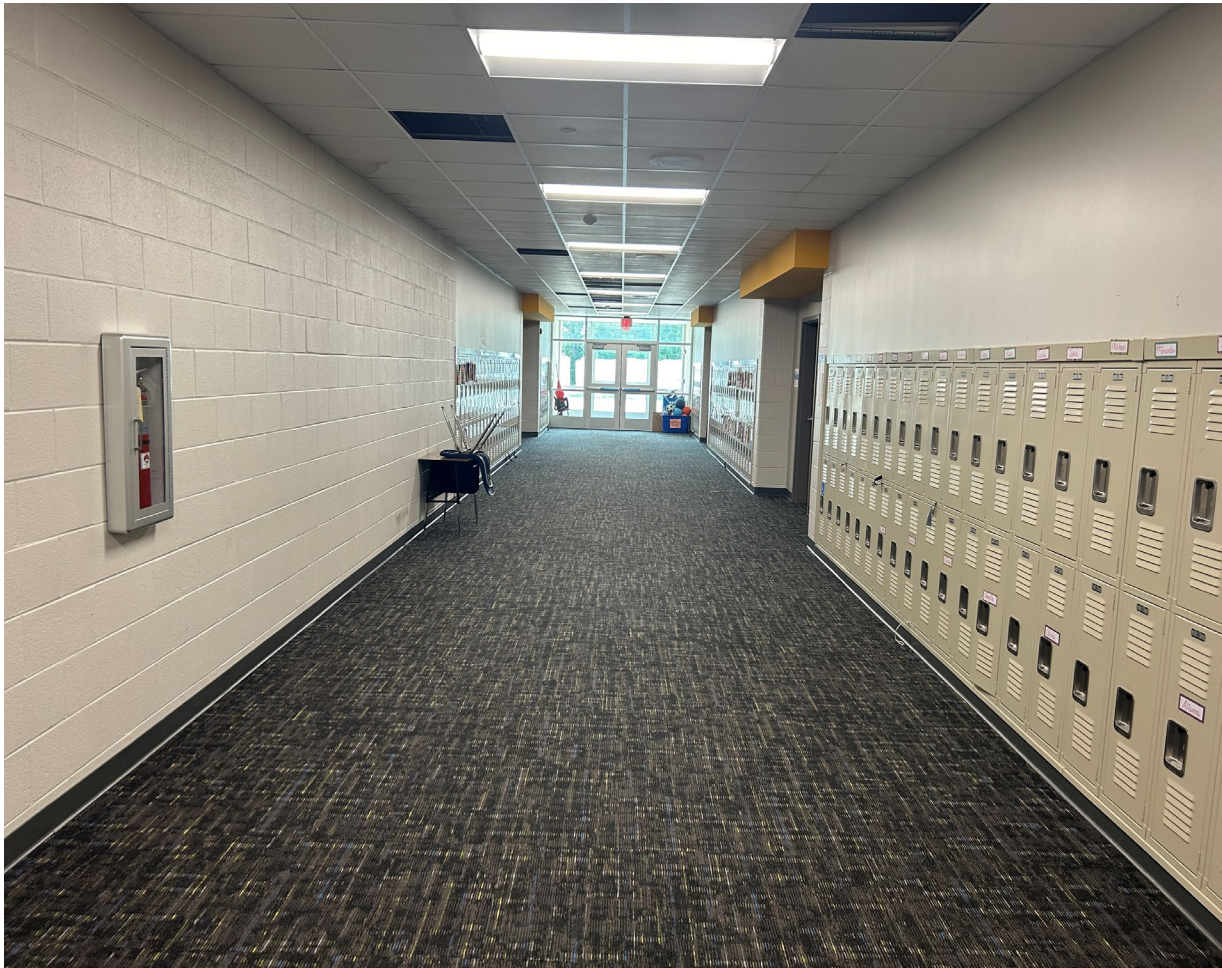
Unit D Hallway