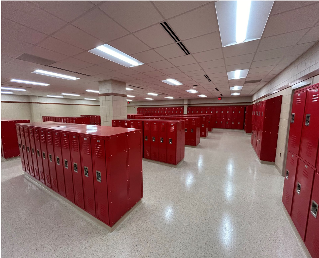
New Locker Commons Area