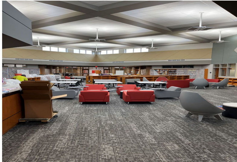
New Media Center Furniture