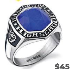
Davis Traditional Large KS100 (L)