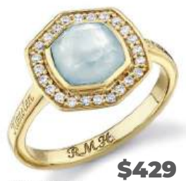
Davis Halo KS300 (S) 🔥