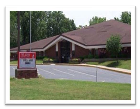
Mt. Zion Grade School "Mt. Zion Grade Rocks!"

Mt. Zion Grade School continues the tradition of highquality education in a safe and nurturing environment. We appreciate your entrusting us with your child's education, and we certainly encourage the participation of parents and guardians in their child's education at both home and school. Open and honest communication serves each child best. Therefore, we will contact you if any concerns arise. Likewise, we ask that you feel free to contact us at 864-3631. We also enjoy visitors, so please plan to attend as many family events as possible, and please remember to sign in at the office as required. The staff of Mt. Zion Grade School looks forward to you and your child joining us. By working together, we can help ensure a productive and rewarding learning experience for all of the children at Mt. Zion Grade School!