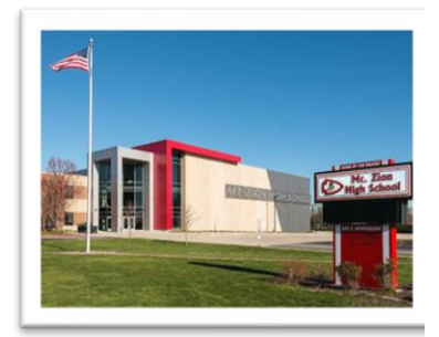
Mt. Zion High School Go Braves!

Please help us set a positive tone in getting the school year off to good start by making appropriate choices when purchasing school clothes. We ask that clothing be safe and respectful.