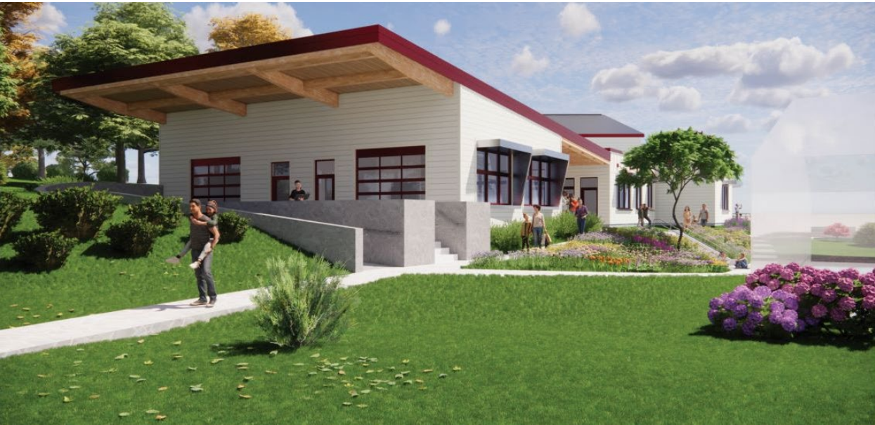
CENTER FOR IDEAS: EXTERIOR VIEW OF MATERIALS DESIGN & ROBOTICS LABS