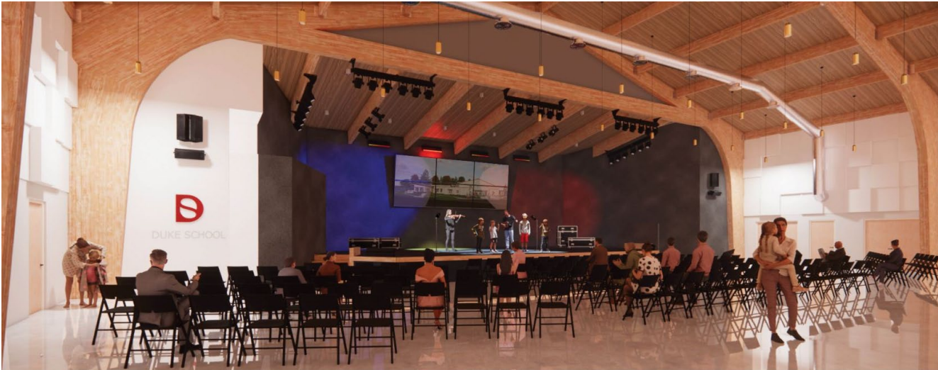
CENTER FOR IDEAS: AUDITORIUM INTERIOR VIEW