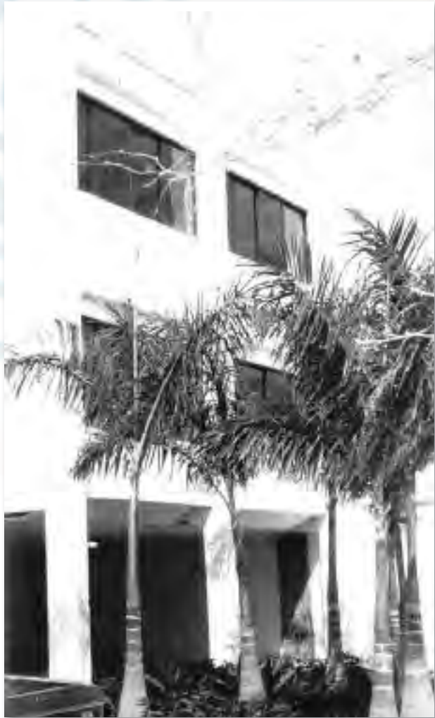
The Abraham Science Building & the Korth Athletic Center were dedicated at the school's 25th Anniversary Celebration, 1984