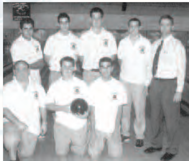
Golf & Bowling Teams win State Championships, 1999