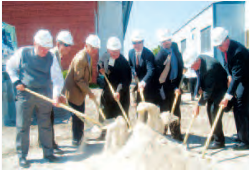
Ground breaks on Mas Technology Complex, 2006