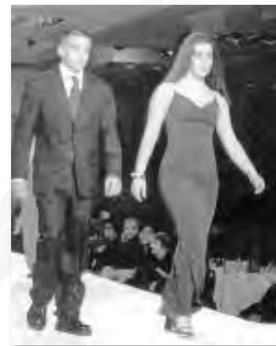
Fashion Show 2000