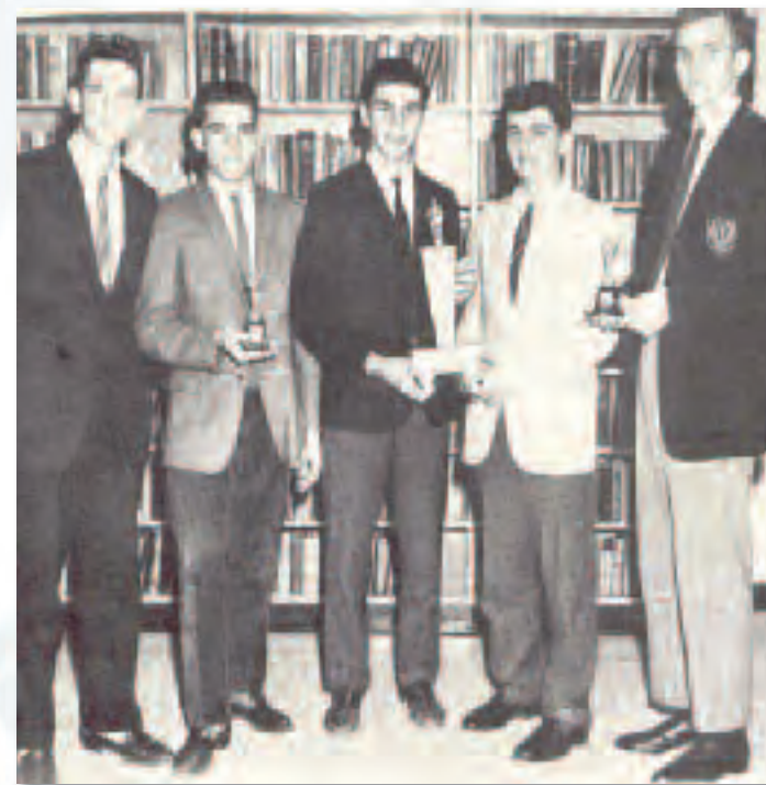
Debaters Placed 1st in the Catholic Forensic League, 1960