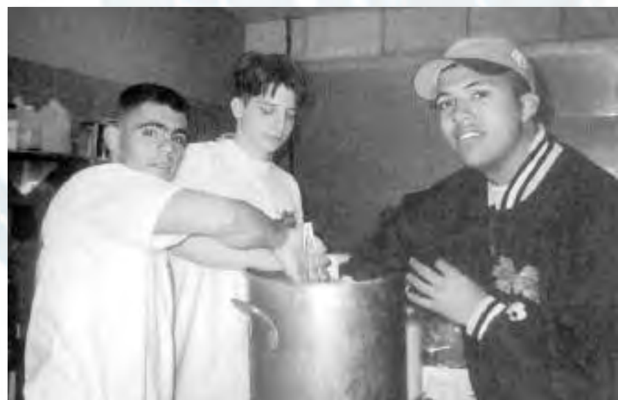
Students volunteering in kitchen, 1998

The Key Club initiated 200 members, the largest number in history, 1998.