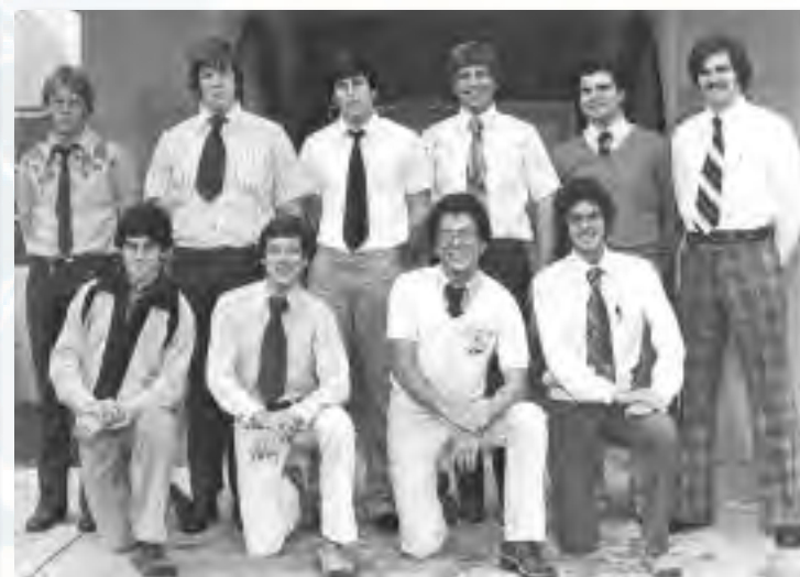
Seniors travel to Wash. D.C. to participate in the Close-up Program for the 1st time, 1975