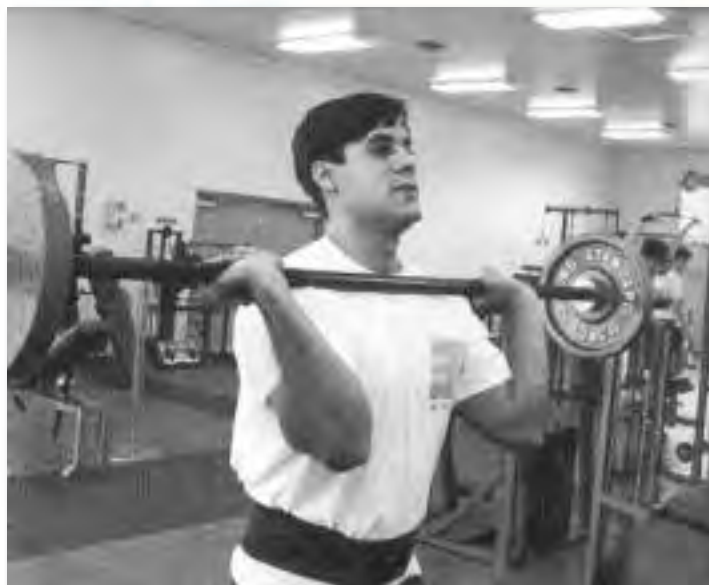
Jim Bernhardt Weight Room opened, 1992