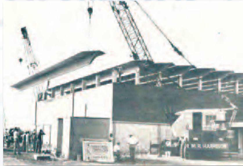
Gym Construction, 1961