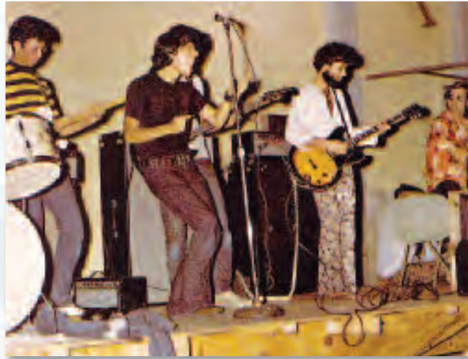
CCHS Pop Festival, 1969