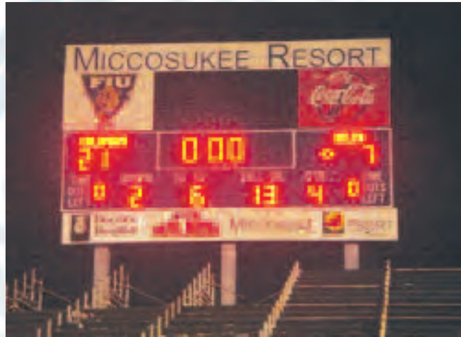
A crowd of over 10,000 gathered at FIU stadium to watch the CCHS varsity football team defeat Belen 21-7, 2005

CCHS is named one of top 50 Catholic High Schools in the U.S, 2004. No other Catholic H.S. in Miami-Dade was selected. The school will go on to consistently receive this distinction.