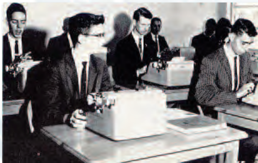
Log Newspaper Staff, 1963

The CCHS Gym Made History in 1961. Its pre-cast beams were the largest ever constructed in South Florida.