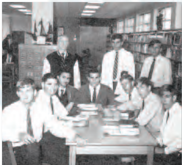
The library was completed in the C building, 1968