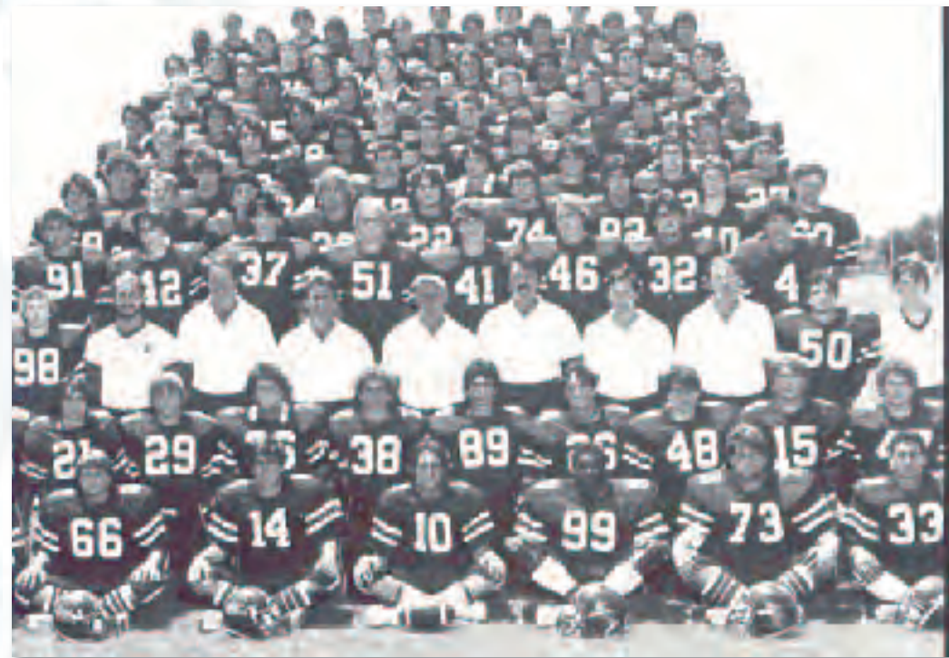
Varsity Football won the District, Regional, & Sectional Crowns, 1982