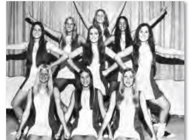
Varsity cheerleaders, 1972