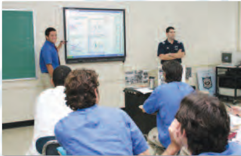
Smartboard technology is introduced in classrooms, 2004

Edline (the on-line report of homework and grades) is established at CCHS, 2003.