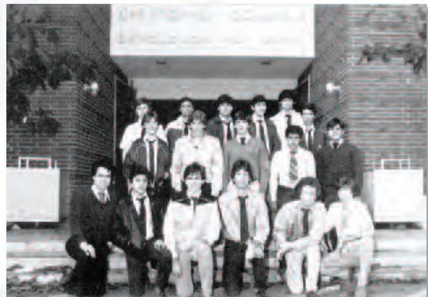
The Math Club won the Florida Mathematics League Championships, 1982