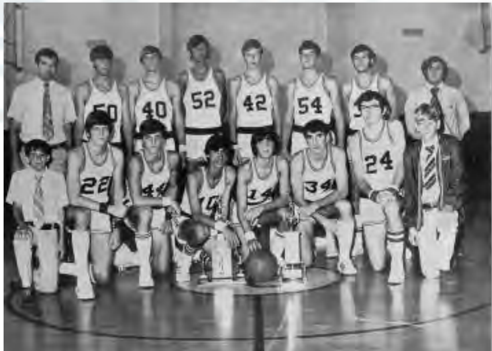
1972 Basketball Team – District Champions

CCHS started a flying club in 1970, the school owned two planes.