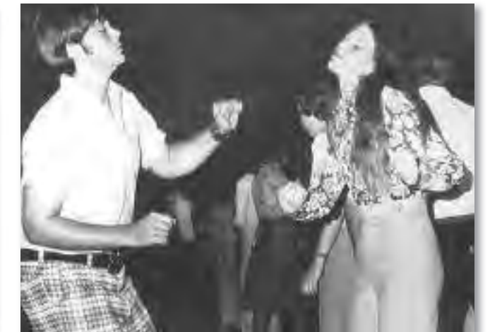
Sock Hops were popular after basketball games, 1976