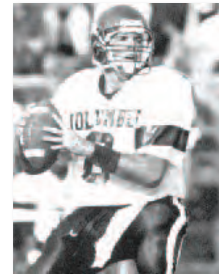
Quarterback Brian Griese set the school record, throwing for 1,400 yards, 1992