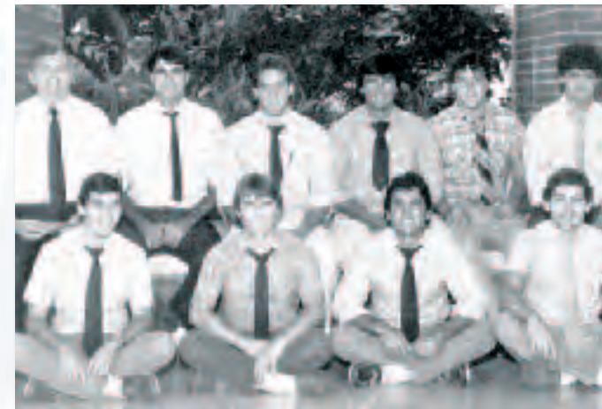
Campus Ministry Leaders, 1984

Campus Ministry implemented Encounter, Kerygma, and Emmaus Retreats to enrich Explorer spirituality, 1981.