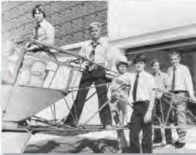
Flying Club, 1970

CCHS started a flying club in 1970, the school owned two planes.