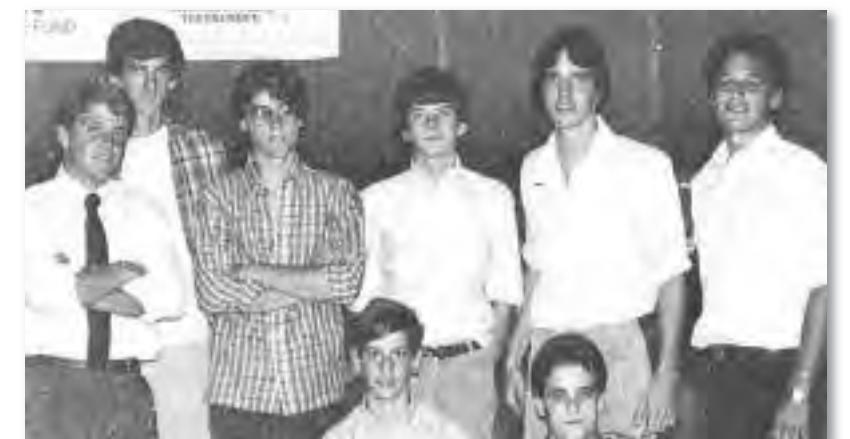
Bowling Team – District Champions for the 1st time, 1985