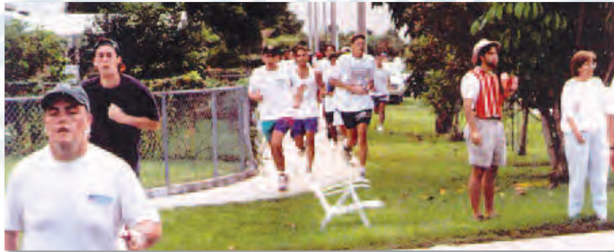
CCHS' 1st Walkathon raised $95,000, 1993