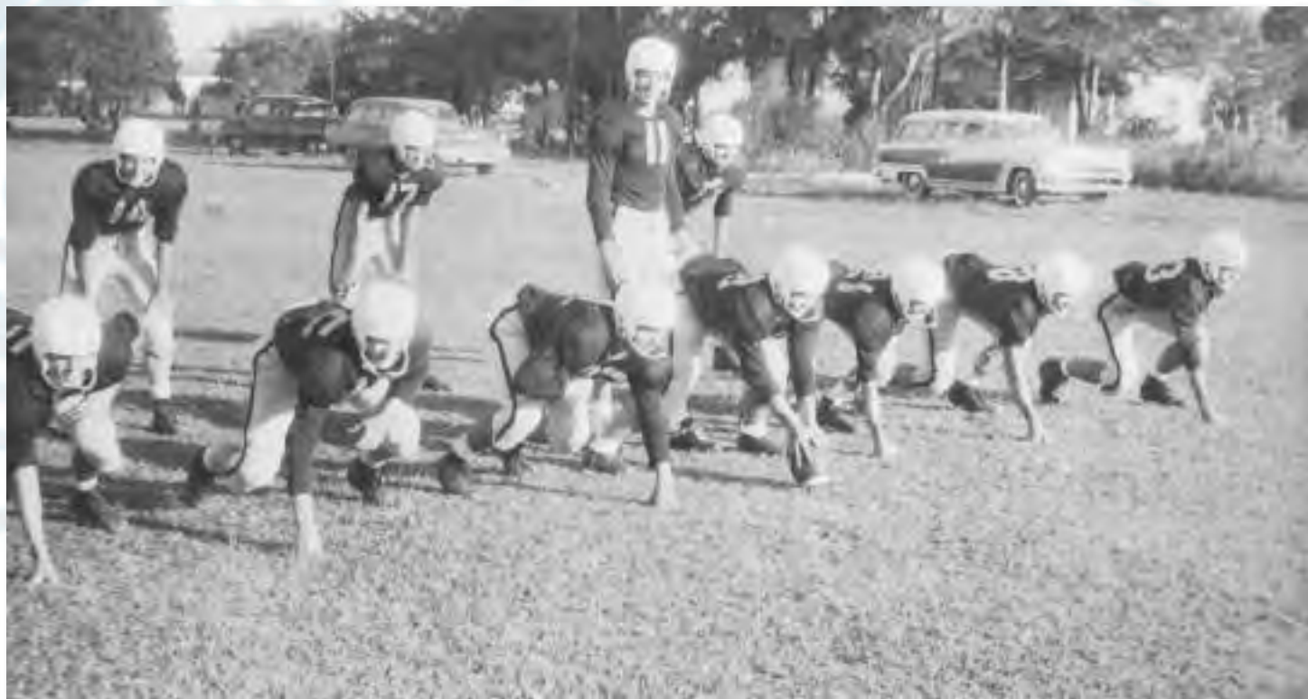
Football Team, 1958