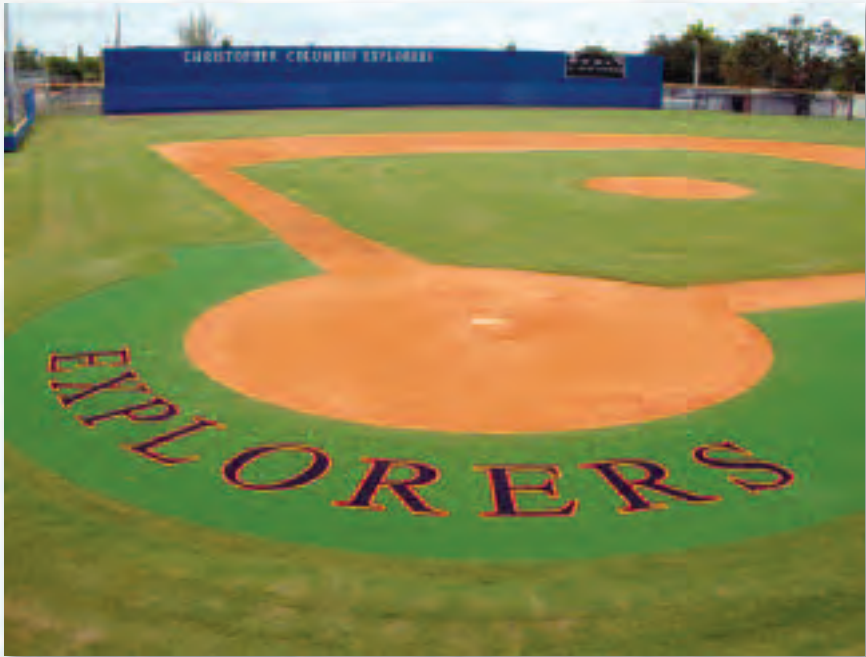
New baseball complex opens complete with the blue monster, 2004

Tuition cost $5,850 and the enrollment was 1,340 students, 2004.