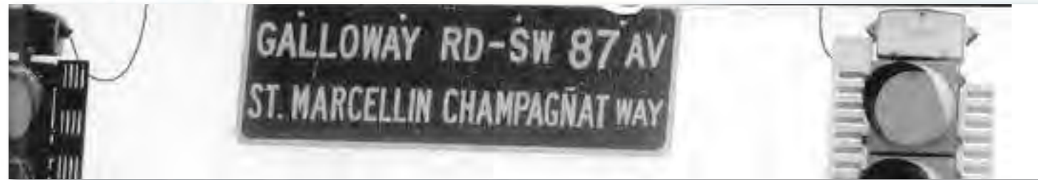
87th Avenue is declared St. Marcellin Champagnat Way, 1998

The inaugural freshman field day is held, 1998.