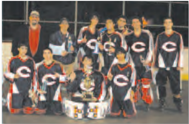
Roller Hockey Team wins the Florida Inline Scholastic League Championship, 2005

More CCHS students take AP classes than any other Catholic school in Miami-Dade county and their averages are higher than the Florida and National Average, 2007.