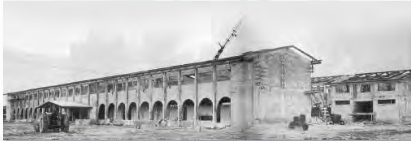
Construction of CCHS Main Buildings, 1957

Located at the western edge of Miami, Columbus was built at a time when the Catholic Church considered Dade County to be missionary territory. The initial construction of the various classroom buildings, gymnasium, cafeteria, and the athletic fields, together with the steady stream of young men coming to Columbus in ever-greater numbers attested to the fact that CCHS had something very special to offer. Enriched by the devoted enthusiasm of the first group of teachers, parents and loyal friends of the school, a unique spirit began to develop, which would grow stronger, deeper and richer as the years went by. Columbus quickly made a name for itself as a first-rate Catholic, academic school, dedicated to the principle of educating young men in all aspects of life.