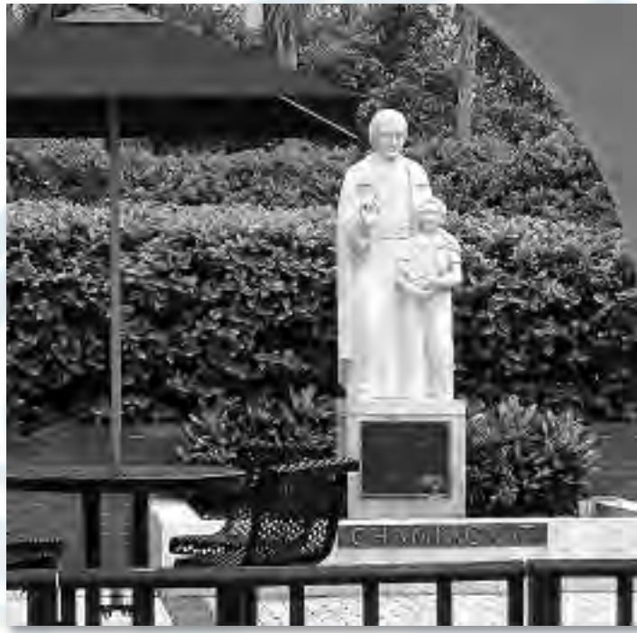
Champagnat Plaza opens commemorating Cuban Maristas, 1987