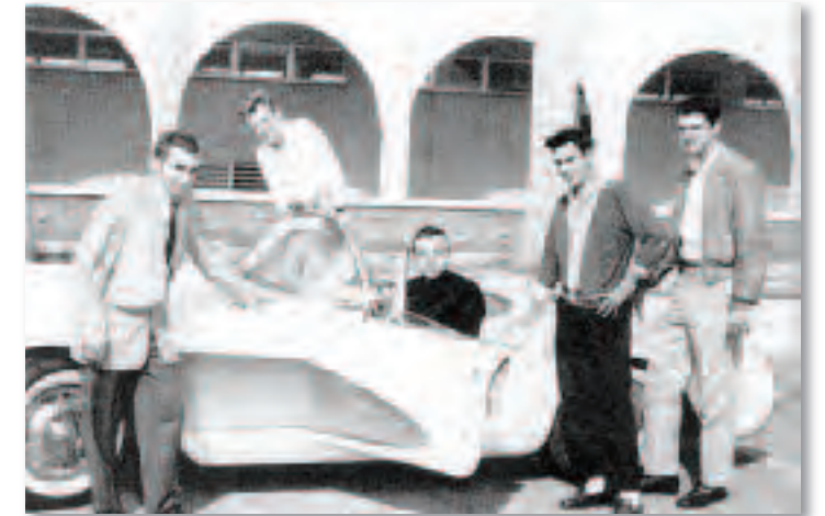
Automobile Club, 1959

CCHS opened in September, 1958 with an enrollment of 139 students and 2 ½ buildings.