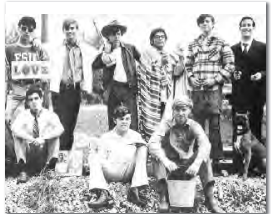
The Adelante Yearbook Club, 1971