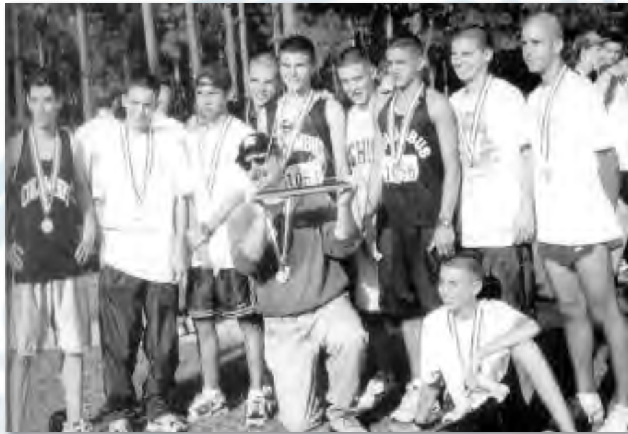
Cross Country Team, State Champions, 1997