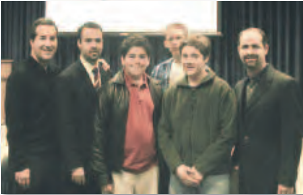
The Mas Family Scholar's Program started at CCHS, 2005. It was considered to be one of the most challenging high school curriculums in South Florida.