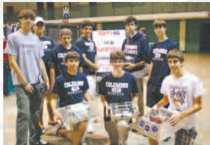
Robotics club members placed 1st and 3rd in the national robotics competition, 2008