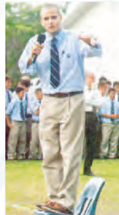
Official CCHS Uniforms are instituted, 1996