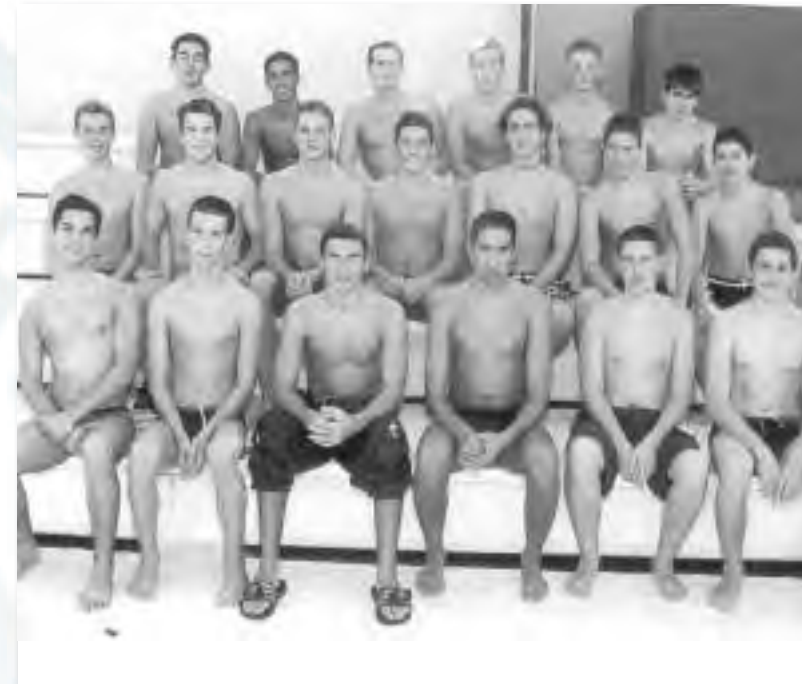
Swim Team won district and GMAC titles, 2000