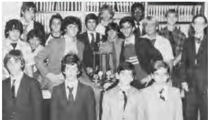
Forensics Club ranked 1st in the Catholic Forensic League, 1980

In 1979 tuition was $1,070 and the enrollment was 960 students.