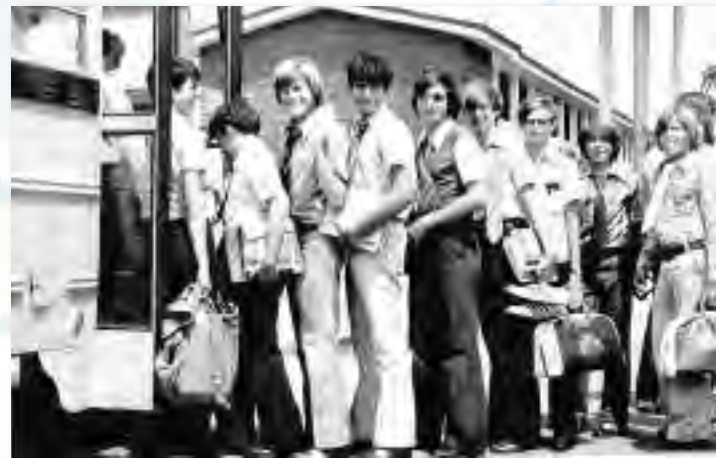
CCHS purchases the largest school bus in the county, 1972