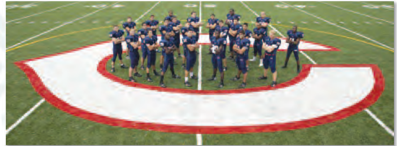
The Football field is renovated to include professional synthetic turf and a scoreboard, 2007