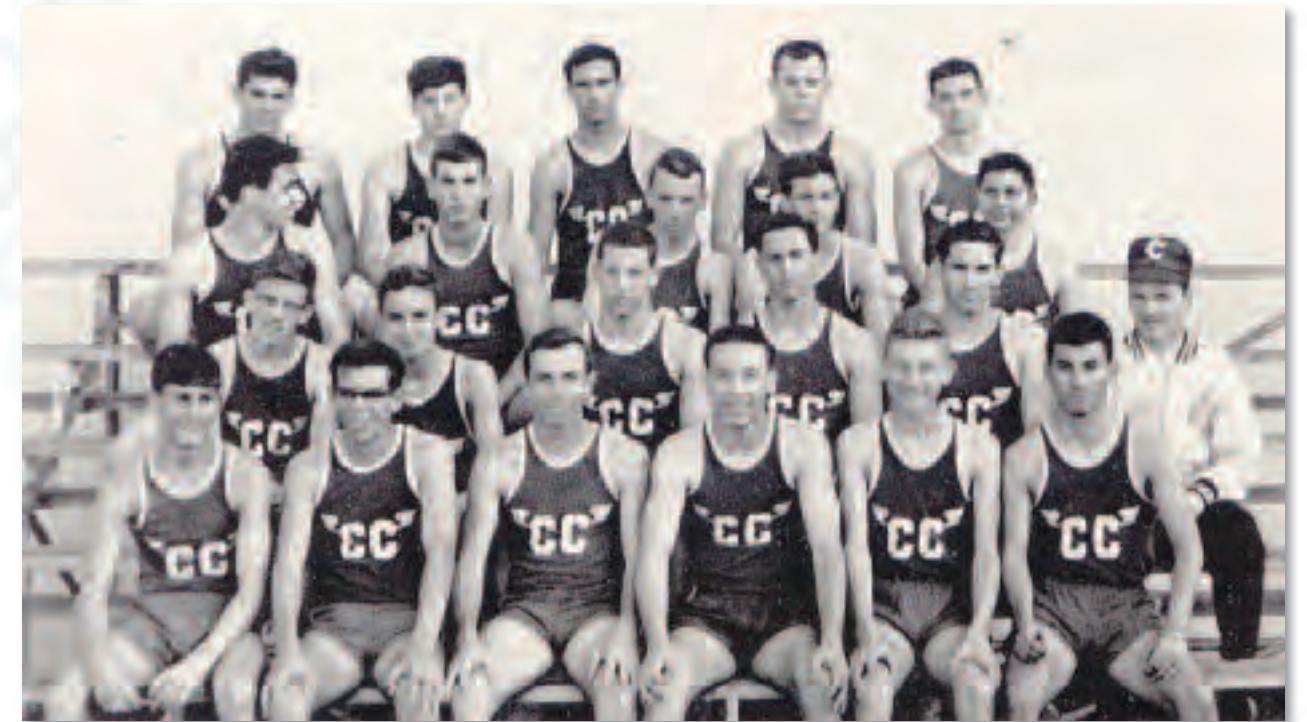
Track Team, District Champions, 1963