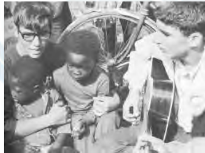
Students help poor migrant children in South Dade, 1969