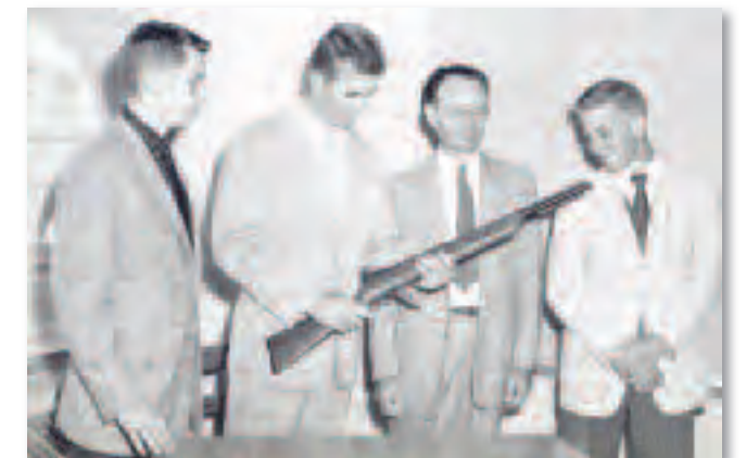
Rifle Club, 1959

No evidence exists for naming the school after Christopher Columbus, but it is thought that the Knights of Columbus were instrumental in the choice. They provided substantial funding.