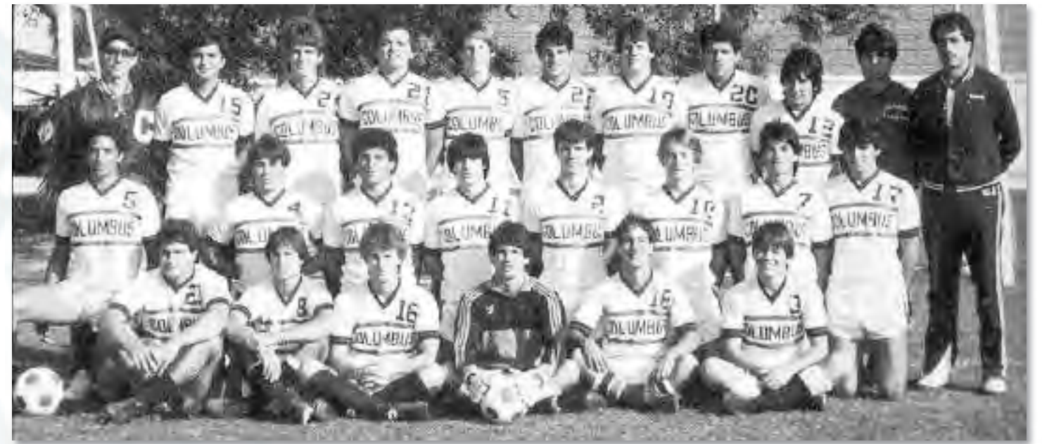
Soccer Team wins 1st district title, 1984

Campus Ministry implemented Encounter, Kerygma, and Emmaus Retreats to enrich Explorer spirituality, 1981.