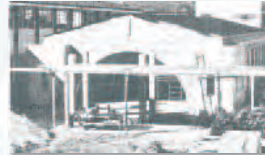
Lawrence Bell Media Center is built, 1995