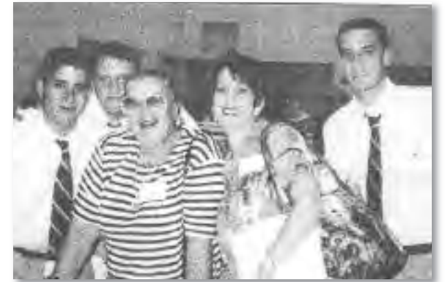
The Knights of Columbus granted the Barnabas Award to the Squires Club, 1999