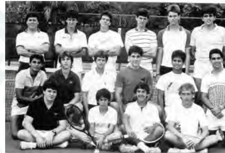
Tennis Team captures the 1st state championship by a CCHS team in history, 1987