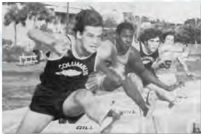
The new track was completed in 1971 and squad won the GMAC southern division title