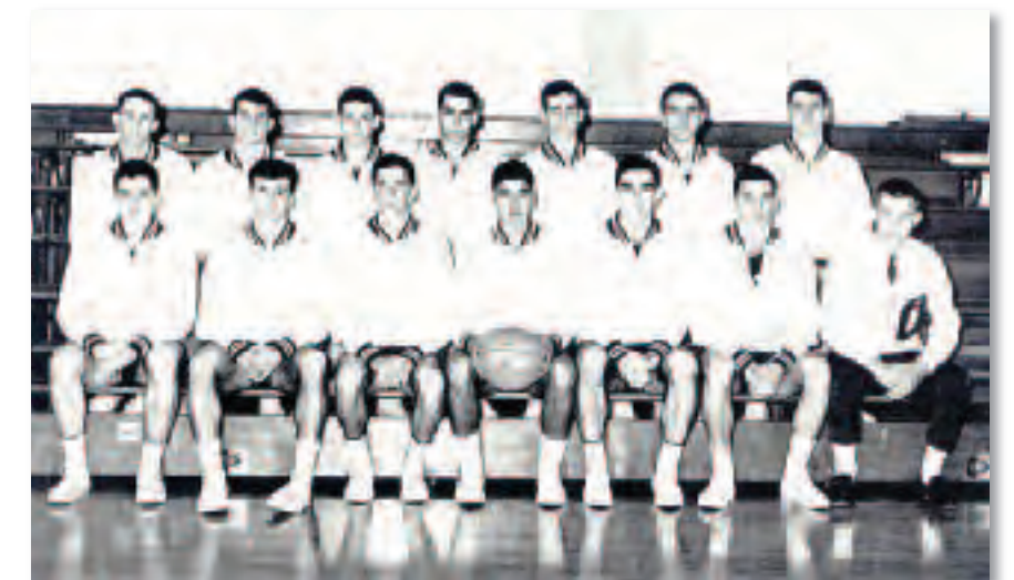
Basketball Team Wins 2nd Consecutive District Championship, 1965