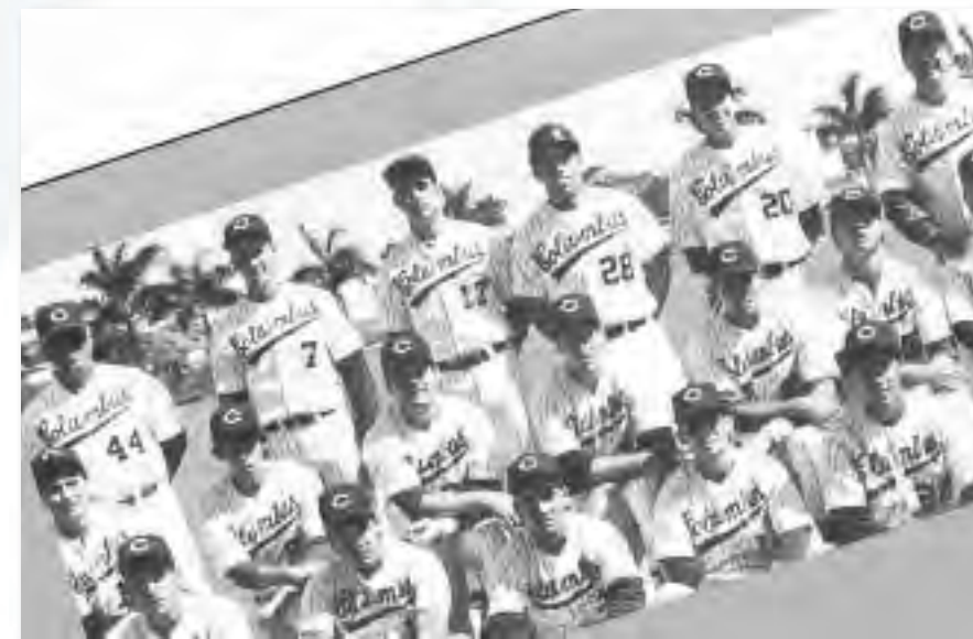
Baseball wins Regional Championships and played for the State Championship, 1988