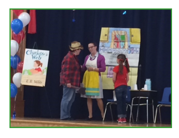
Lawrence Brook: One School, One Book