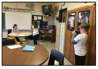
Frost: You're On! Using Video Cameras to Enhance Classroom Learning at Frost School

The East Brunswick Education Foundation (EBEF) provides grants for deserving programs, proposed by teachers to benefit students. The EBEF is a non-profit organization, run by community volunteers dedicated to enhancing and enriching the educational program for students attending East Brunswick Public Schools. Grant money comes from individuals, like you, who care about the children in our community and are committed to educational excellence.