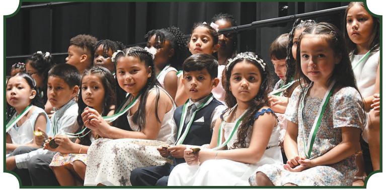
East Elementary School students with their medals signifying graduation from kindergarten.