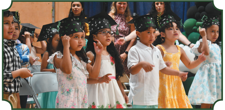
Hemlock Park Elementary School gets into the spirit during their Kindergarten Rising ceremony.