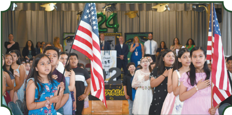
Loretta Park Elementary School Class of 2024 graduates sing hold the American flag and sing the national anthem at their Moving Up ceremony.