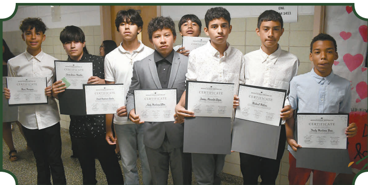
North Middle School students pose after receiving their Certificates of Advancement to ninth grade.