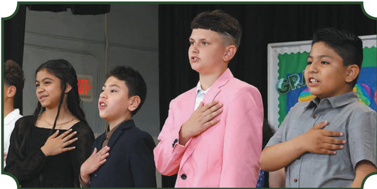
Students recite the Pledge of Allegiance at Southwest Elementary School's Fifth Grade Moving Up Ceremony.