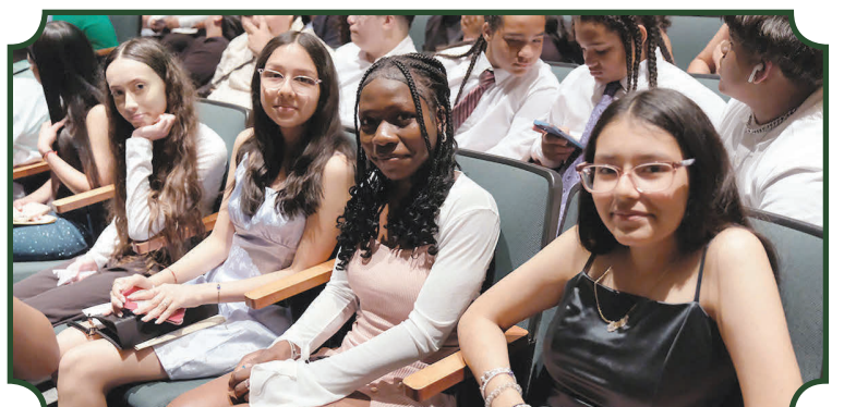
West Middle School eighth grade students await their turn to approach the stage during their Moving Up Ceremony.