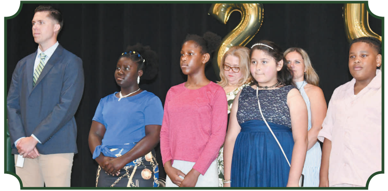
Oak Park Elementary School students and staff stand for the Pledge of Allegiance at their Moving Up ceremony.