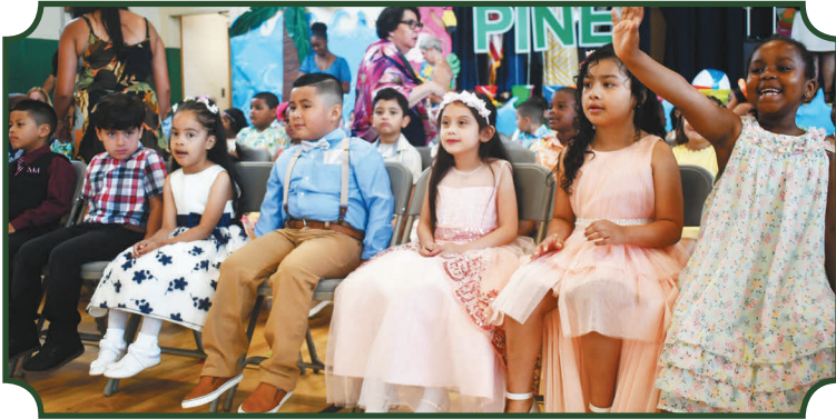
Kindergarten students at Pine Park Elementary School look out at their parents taking photos during their Moving Up Ceremony.