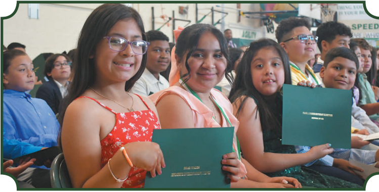
Southeast Elementary School Class of 2024 graduates proudly hold up their diplomas.