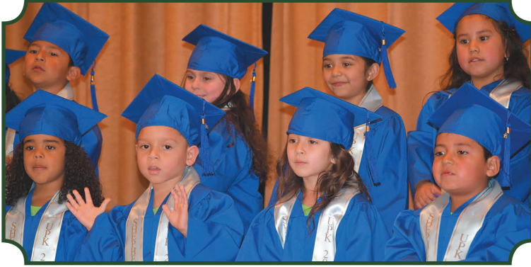
Universal Pre-K students at Shepherd's Gate Academy sing their post-graduation song to celebrate moving up to kindergarten.