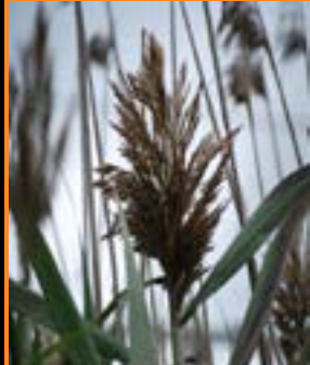
Invasive Species-Phragmites "Phragmites australis"