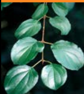
Invasive Species - Common Buckthorn "Rhamnus cathartica"