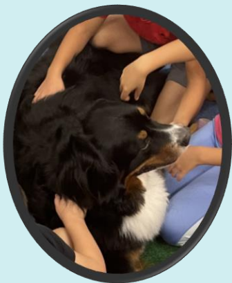
Patron surrounded with love by students during class time.