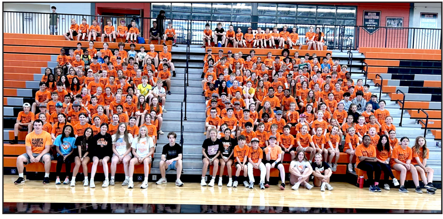
ONE NATION Summer Sports Camp - 3rd through 8th grade students