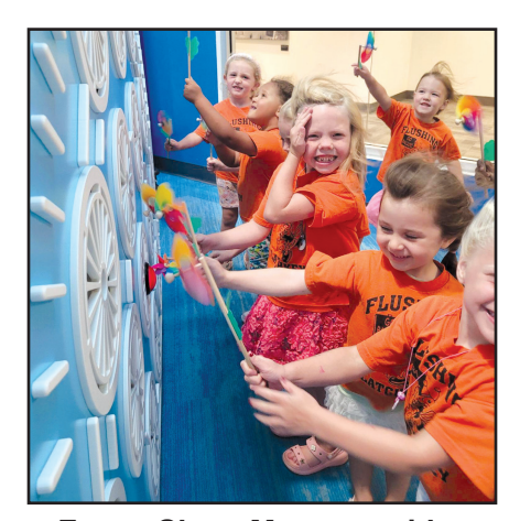
Fun at Sloan Museum with Summer Latchkey Students!