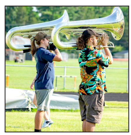
Flushing Marching Band gearing up for great performances this year!