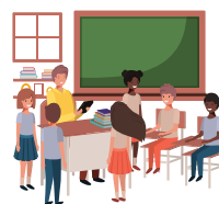
Shelter in Place