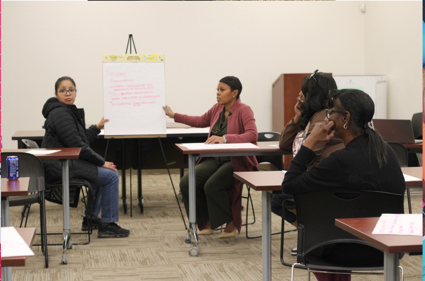
Parent Advisory Committee Provides District Feedback