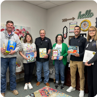
Read Across America