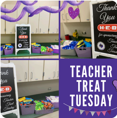
Teacher Treat Tuesday