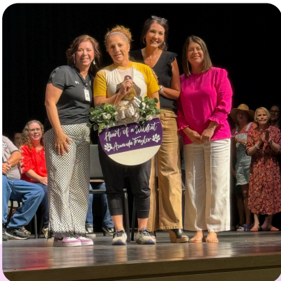
Heart of a Wildkat Award