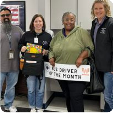
Bus Driver of the Month