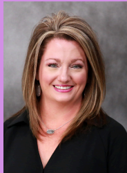
Vice President of Events & Marketing