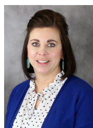
Community Involvement Liaison