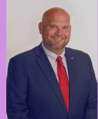
Vice President of Finance