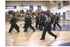
Drill Team without weapons