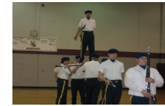
Honor Guard Exhibition without weapons