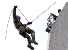
JROTC Cadet Leadership Course/Camp (JCLC)