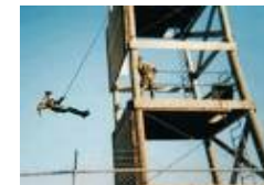
Raiders Competitive Endurance Team