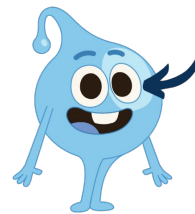
Eyes are watching